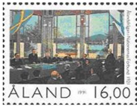
The Åland stamp issued in 1991, depicting the session on the Åland question of June 24, 1921, at the League of Nations in Geneva.

The Åland stamps are important symbols of the autonomy.