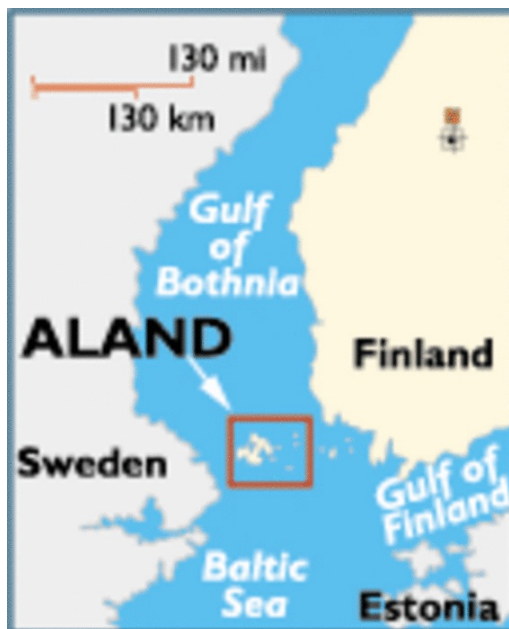
Åland Islands map

First to discuss is the territorial sovereignty issue. Putting the conclusion first, the question of sovereignty over the Northern Territories, or border demarcation between Japan and Russia, should be resolved as soon as possible, as the core of the issue lies here. Sovereignty over the islands was also the core of the Åland question, and that of Finland was confirmed in the end. This has not changed.