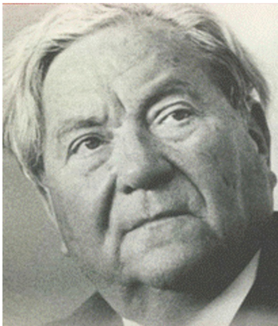
Carlo Schmid (1896-1979)

IV. In Germany, Carlo Schmid, the “superb enlightener . . . statesman . . . [and] advocate of humanity” (as publicist Walter Jens has called him), had argued in 1948-49 before the Parliamentary Council for putting limitations on sovereignty into the Bonn Constitution (Basic Law). Carlo Schmid, who was then Professor at the University of Tübingen and State Minister of Justice, also had the UN in mind. The committee under his chairmanship dealing with questions of peace and security was “unanimously of the view that the Constitution should provide that the Federation can, through a law passed and adopted by a simple majority vote, delegate sovereign rights to international institutions.” (Der Parlamentarische Rat—hereafter PR: 206) This would be the logical and suitable follow-up to the Japanese precedent, which many see as a “motion” to abolish war, in need of being “seconded” by some other country or countries.