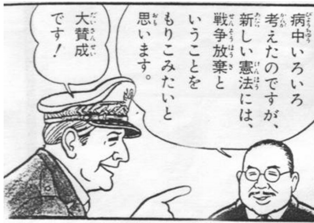
Shidehara suggesting the abolition of war to MacArthur in a popular history manga. However, with the Gulf War and the criticism heaped on Japan for its “check-book diplomacy,” the bubble with Shidehara’s suggestion was shifted to come from MacArthur.

MacArthur could not have agreed more. There is no doubt that the January 24 meeting between MacArthur and Shidehara took place. Both Shidehara’s and MacArthur’s accounts agree that it was Shidehara himself who suggested that an article similar to or identical in content with the later Article 9 be included in the Japanese Constitution. In his memoirs MacArthur wrote: “It has frequently been charged, even by those who should be better informed, that the ‘no war’ clause was forced upon the [Japanese] government by my personal fiat. This is not true.” (MacARTHUR: 302)