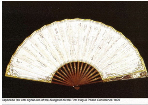
Japanese fan with signatures of the delegates to the First Hague Peace Conference 1899