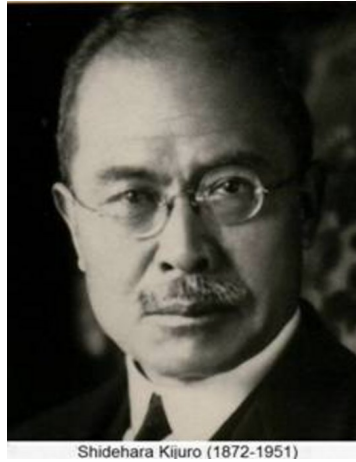
Shidehara Kijuro (1872-1951)

II. Like France, Japan also gave itself a new Constitution after the Second World War, which was ended with the dropping of the two atomic bombs over Hiroshima and Nagasaki in August 1945. The victorious powers (without France) had decided in the Potsdam Declaration of 26 July 1945 upon the total disarmament of Japanese troops, the punishment of war criminals, the prohibition of industries which could make possible Japan's rearmament, as well as the establishment in Japan of a peace-loving responsible government (Arts. 9-12). The Declaration was signed by the United States of America, the United Kingdom, China, and later also by the Soviet Union. On 10 August 1945, compelled by the atomic blasts on Hiroshima and Nagasaki and the Russian declaration of war on August 8, the Japanese government announced that it was "disposed to accept" the Potsdam Declaration. On the following day the Allies communicated to the Japanese government: "The ultimate form of Japan's government will, in keeping with the Potsdam Declaration, be determined through the freely expressed will of the Japanese people." On 14 August the Emperor ordered acceptance of the Potsdam terms, and with this the war in the East was ended and peace finally achieved. On 2 September the articles of surrender were signed on board the US-battleship Missouri .