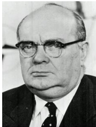
Paul-Henri Spaak (1899-1972)

The French concluded that the international community could “not advance without [reliable and effective, global] ‘institutions’. To create these was only feasible and made sense only when states delegated to [these institutions] certain competencies which they had earlier exercised themselves.” (REUTER: 97) In this way individual nations eventually could be relieved of their traditional obligation to look after their and their populations’ own peace and security. Consequently it was the obligation of other states, according to the stated principle of reciprocity, to take the steps needed on their part for putting into practice the security system of the United Nations. Germany was seen as chief postwar ally to cooperate in this task. “So long as the dogma of sacrosanct national sovereignty is not overthrown,” a delegate said before the European Congress at The Hague in May 1948, and so long as the nations have not yet “thrown together their governments,” as Paul-Henri Spaak, the Belgian socialist leader, and one of the founding fathers of the European Union, expressed it, permanent, durable peace would not be achieved.