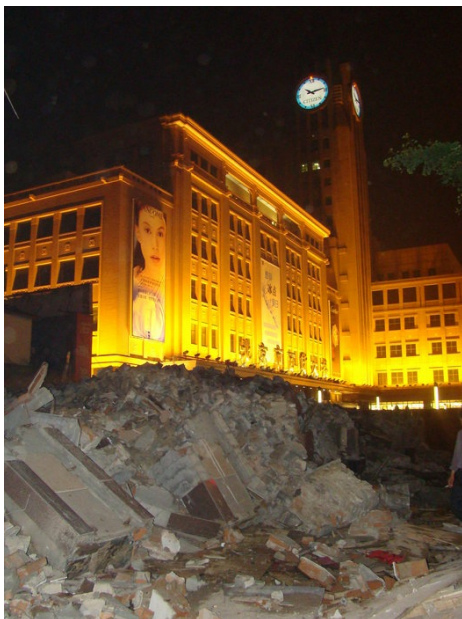
Demolition along Wangfujing Street, Beijing, May 2008

It may be that the Beijing Games will initiate a period of regular bids for Olympic Games. I was in Shanghai in November 2008, where preparations for the 2010 World Expo are ramping up now that the Olympics are over, and the mood in the municipal government is currently positive toward a future Olympic bid. However, when Chinese scholars refer to an anti-Olympics movement, they refer to opposition to the state-supported sport system and the government’s neglect of popular and school sport. In 1964 Japan placed third in the gold medal count and in 1988 South Korea placed fourth, their highest placements of all time. Chinese sportspeople believed that their first place in their own Olympics might also be the peak of China’s state-supported sport system, and that the pursuit of gold medals might be downgraded after the Games and more attention given to school and recreational sport. The Director of the State Sport General Administration, Liu Peng, took a preemptive stance immediately after the Olympic Games in an interview in the People’s Daily on September 6, stating, “Our position on the state-supported sport system is clear: One, we will maintain it; two, we will perfect it.”[19] But the debates about the future of the state-supported system are still going on.