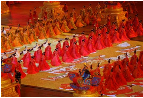
Tang Dynasty Symbolism in the Opening Ceremony.

In the end, the only significant violence did not pit sovereign states against one another but took place in China's Tibetan areas. However, this should not mislead us into thinking that the Beijing Games did not take place in the shadow of war – a point that, I believe, was very present in the minds of the East Asian audience but was missed by Westerners with shorter and more spatially distant memories. And it is important to remember that the Beijing Olympics were the first Olympics to take place in an East Asian country that is not host to U.S. military bases. This was the “present absence” in 2008 in comparison to Tokyo 1964 and Seoul 1988.