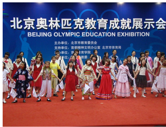
International song and dress at the Olympic Education Exhibition, May 2008.

One illustration of this point is a conversation I had with a Tsinghua University student who, as an Olympic volunteer, was standing beneath the flagpole when the Chinese flag was raised in the Olympic opening ceremony. He asked me what I thought of Beijing's Olympic education programs – didn't I find that much of it was just a "show" by the government? I told him that while many of the activities might be considered to be "appearance-ism," I thought that teaching students that their country was taking its place among other nations as an equal, and that China would no longer be "bullied" by other nations, would have an important effect on the students for the future. He was silent for a moment, and then confessed that when he saw the Chinese flag being raised in the stadium and heard the wild cheering of the crowd, he had gotten tears in his eyes, and this had been the first time in his life that this had ever happened to him. From this perspective, he agreed with my conclusion. Our conversation took place during a dinner to which I had been invited so that I could advise him on whether to accept admission to the Master's Degree programs at the University of Pennsylvania or the University of Southern California, with an eye to which city would offer better future employment opportunities.