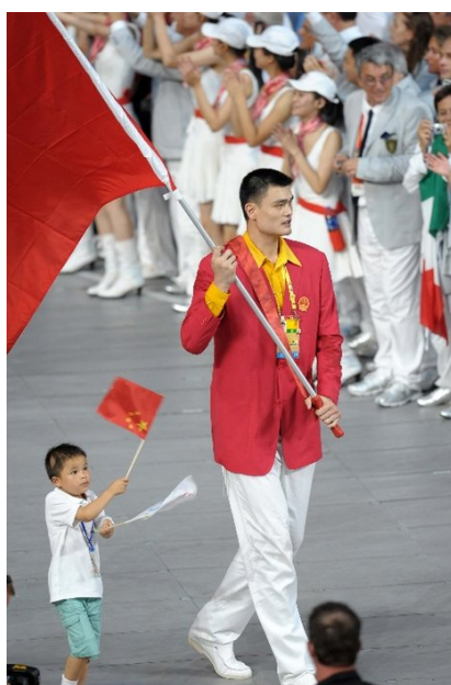
Yao Ming, flagbearer for China, enters the stadium with Lin Hao, earthquake survivor.

As in the lighting of the torch by Sakai in 1964, the incident in the Paris leg of the torch relay, when a Tibetan protester tried to wrench the torch away from a young Chinese female Paralympic athlete in a wheelchair, produced an image of China as a victim that received a great deal of attention in the Chinese media. The victimization function was further carried out by the nine year-old survivor from the Sichuan earthquake disaster area who entered the stadium beside the flagbearer, basketball icon Yao Ming, in the opening ceremony. The small flag carried by the boy was upside down, an international nautical symbol for distress. However, it appeared that the boy had unintentionally flipped the flag, because no official explanation was issued, and Xinhua news agency requested clients not to use a photo of it shortly after sending it out. While not as forceful as the image of Japan victimized by the atom bombs, within China these symbols did preserve the Chinese narrative of victimization in the midst of the most grandiose Olympics ever.