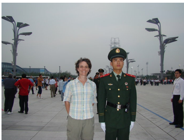
The author posing with a soldier guarding the VIP lane at the closing ceremony, following the example of Chinese spectators.