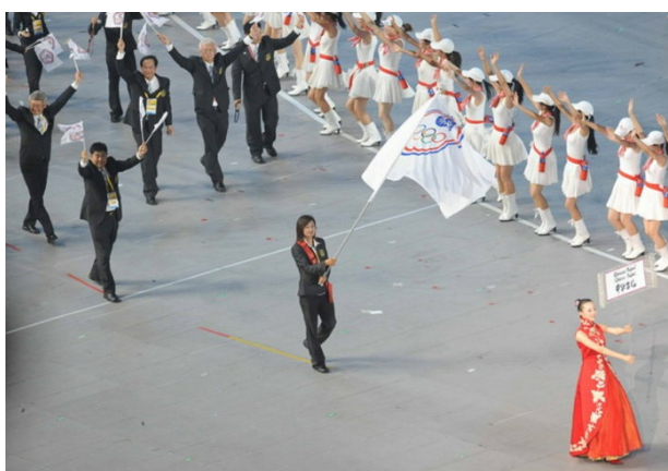
Chinese Taipei enters the stadium in the opening ceremony.

As in the lighting of the torch by Sakai in 1964, the incident in the Paris leg of the torch relay, when a Tibetan protester tried to wrench the torch away from a young Chinese female Paralympic athlete in a wheelchair, produced an image of China as a victim that received a great deal of attention in the Chinese media. The victimization function was further carried out by the nine year-old survivor from the Sichuan earthquake disaster area who entered the stadium beside the flagbearer, basketball icon Yao Ming, in the opening ceremony. The small flag carried by the boy was upside down, an international nautical symbol for distress. However, it appeared that the boy had unintentionally flipped the flag, because no official explanation was issued, and Xinhua news agency requested clients not to use a photo of it shortly after sending it out. While not as forceful as the image of Japan victimized by the atom bombs, within China these symbols did preserve the Chinese narrative of victimization in the midst of the most grandiose Olympics ever.