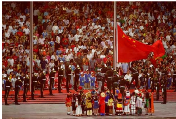
The raising of the Chinese flag in the opening ceremony.

One illustration of this point is a conversation I had with a Tsinghua University student who, as an Olympic volunteer, was standing beneath the flagpole when the Chinese flag was raised in the Olympic opening ceremony. He asked me what I thought of Beijing's Olympic education programs – didn't I find that much of it was just a "show" by the government? I told him that while many of the activities might be considered to be "appearance-ism," I thought that teaching students that their country was taking its place among other nations as an equal, and that China would no longer be "bullied" by other nations, would have an important effect on the students for the future. He was silent for a moment, and then confessed that when he saw the Chinese flag being raised in the stadium and heard the wild cheering of the crowd, he had gotten tears in his eyes, and this had been the first time in his life that this had ever happened to him. From this perspective, he agreed with my conclusion. Our conversation took place during a dinner to which I had been invited so that I could advise him on whether to accept admission to the Master's Degree programs at the University of Pennsylvania or the University of Southern California, with an eye to which city would offer better future employment opportunities.