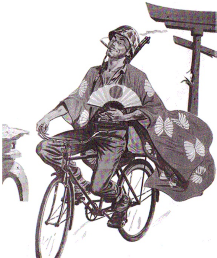
Colliers magazine cover depicting US-GIs in the thrall of Japan

The decision of whether to report a rape, and whether the offense will come to trial, is made by military commanders who retain enormous discretion, particularly in an investigation's early stages, such as the preliminary inquiry. If an officer decides that reporting a rape would be detrimental to military objectives, he may not report it. A recent example is a case in which the military discharged a US soldier accused of raping and murdering a 12-year-old Iraqi girl rather than trying him. 1