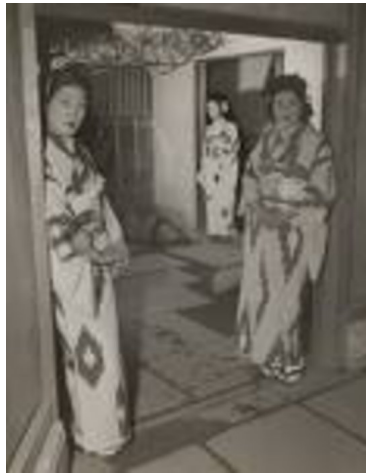
R.A.A. women waiting for GI patrons

Robert Lilly estimates some 17,000 rapes occurred in the European theater during WWII; however, the Judge Advocate General reports a total of 854 cases. 6 Lilly's explanations for the discrepancy include: the length of time it took for the European branch of the JAG to open—7 months—with the office being immediately and permanently overwhelmed, the large number of rapes handled by lesser courts with little documentation, many complaints going unprocessed in order to prevent embarrassing the soldiers or tainting the careers of officers, Army prejudice regarding the rape victim, and a military culture that placed little symbolic value in disciplining soldiers for rape. During a period of high incidence of rape, there might simply be too many cases to process.