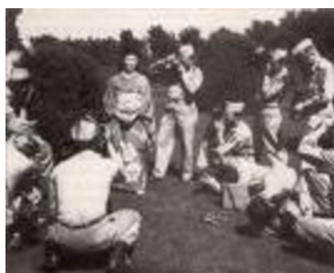
GIs photographing women

. . . US troops comported themselves like conquerors, especially in the early weeks and months of occupation. Misbehavior ranged from black-marketeering, petty theft, reckless driving and disorderly conduct to vandalism, assault arson, murder and rape. . . . In Yokohama, Chiba and elsewhere, soldiers and sailors broke the law with impunity, and incidents of robbery, rape and occasionally murder were widely reported in the press. 12