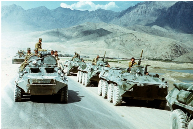
Russian forces in Afghanistan

Meanwhile, especially after 1980, moderate Sufi leaders in the countryside were progressively displaced in favor of radical jihadist Islamist leaders, thanks to massive funding from agents of the Pakistani ISI, dispersing funds that came in fact from Saudi Arabia and the United States. Already in the 1970s, as oil profits skyrocketed, representatives of the Muslim Brotherhood and the Muslim World League, with Iranian and CIA support, “arrived on the Afghan scene with bulging bankrolls.” 5 Thus the inevitable civil war that ensued in 1978, and led to the Soviet invasion of 1980, can be attributed chiefly to Cold War forces outside Afghanistan itself.