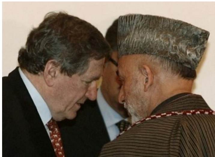
Holbrooke and Afghan leader Karzai

Holbrooke excoriated America's existing drug-eradication strategies, particular aerial spraying of poppy fields: "The ... program, which costs around $1 billion a year, may be the single most ineffective policy in the history of American foreign policy....It's not just a waste of money. It actually strengthens the Taliban and al Qaeda, as well as criminal elements within Afghanistan."