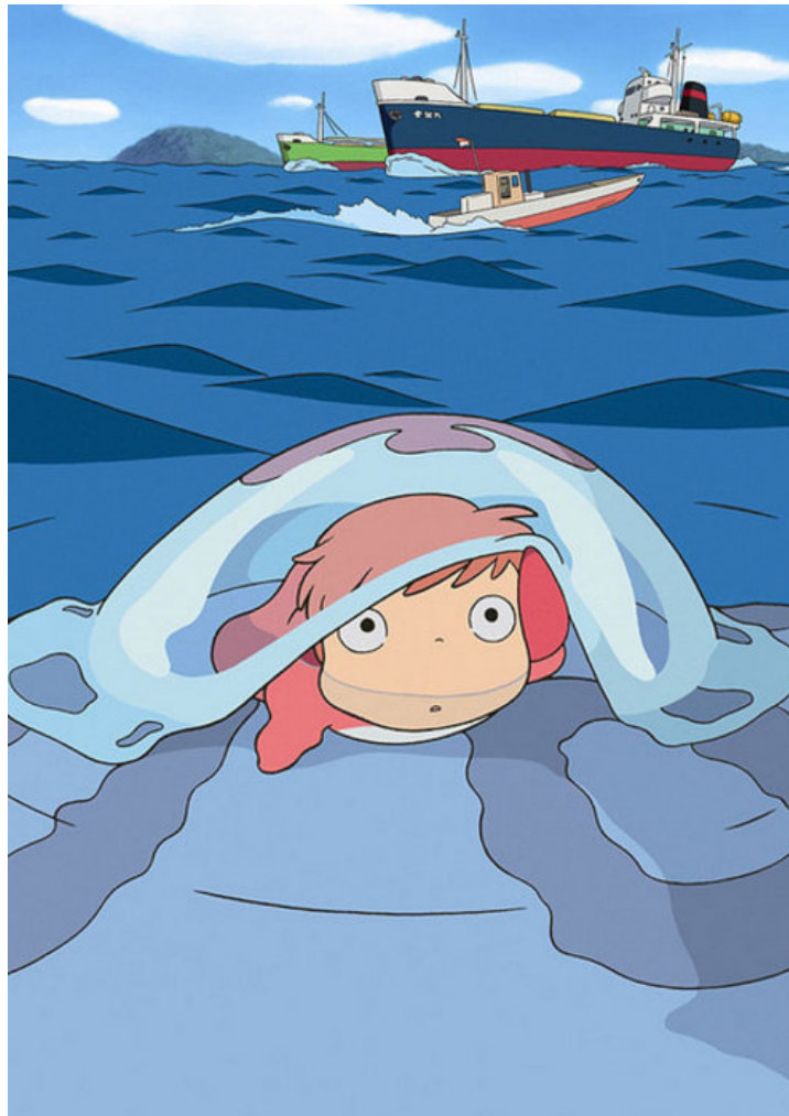
Ponyo on the Cliff still

Miyazaki's 10th movie, the story of a young goldfish that longs to become human, is another chapter in his lifelong struggle to interpret the world of children, explains the director, who says Ghibli has recently built a crèche for its staff where he spends a lot of his time. "I look at them and try to see things as they do. If I can do that, I can create universal appeal." The relationship is two-way, he says. "We get strength and encouragement from watching children. I consider it a blessing to be able to do that, and to make movies in this chaotic, testing world."