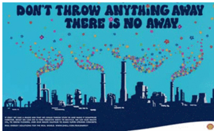
Shell oil ad: A supreme example of greenwashing

There are a host of matters that deserve closer examination here. Among them are the specific details of Japan's energy-environmental policies, especially seen in a comparative context. Allow me to deal with that elsewhere, since the evidence is voluminous and will lead to a lengthy digression. Suffice it to say, for the moment, that Japan is at present well behind its main competitors in innovating and adopting green technology. Years of "we're number 1" nationalism and "mottainai" culturalist rhetoric ended with even the Nikkei, in a March 11 editorial, warning that the country is far behind and calling for a massive Japanese green new deal and smart public policies.