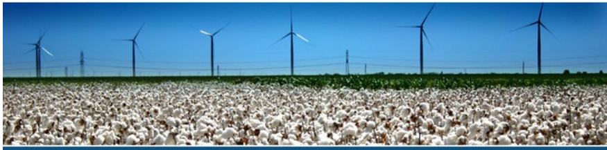
Roscoe wind farm, Texas

And progress in the advanced American states and cities, especially California, has laid a strong foundation for federalizing America’s localized green revolution. Keep in mind that Texas has become a world leader in wind power thanks to a Renewables Portfolio Standard that Bush signed in 1999, when he was Governor. link