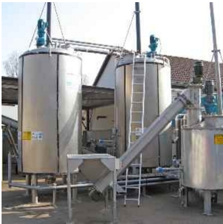
German solar technology

In spite of this multifaceted crisis and its implications for economic policymaking, the Japanese elite continue to hamstring the country in the midst of an incipient green industrial revolution. It takes a Bush-league scale of incompetence to toss away a lead in solar technology, as Japan has done. Japan axed its solar subsidy in 2005, and saw its market share slide. Meanwhile, the Germans in particular were making green technology the core of their domestic energy supply and world-beating export machine. Germany is now “accelerating its efforts to become the world’s first industrial power to use 100 percent renewable energy – and given current momentum, it could reach that goal by 2050.” link