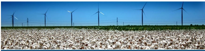
Roscoe wind farm, Texas

And progress in the advanced American states and cities, especially California, has laid a strong foundation for federalizing America’s localized green revolution. Keep in mind that Texas has become a world leader in wind power thanks to a Renewables Portfolio Standard that Bush signed in 1999, when he was Governor. [link]