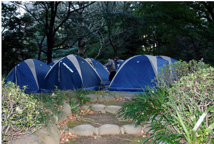
Tents at Hakenmura

The idea for this village emerged from a discussion in December 2008 at a bar in Tokyo among activists and lawyers who had been helping unemployed dispatch workers. These activists organized an executive committee to prepare the village, which opened at Hibiya Park, Tokyo's relatively small "Central Park," over the week from December 31st to January 5th (at which date public offices for the unemployed were supposed to open). The organizers distributed food and lodging, provided counseling and employment consulting services, and helped the residents apply for welfare benefits. The residents pitched tents for their lodgings, but the space was cramped and it was hard to sleep with nighttime temperatures around the freezing point.