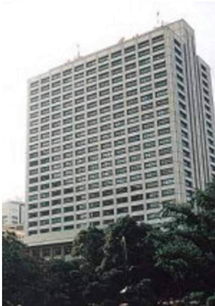
The Ministry of Labor, Tokyo