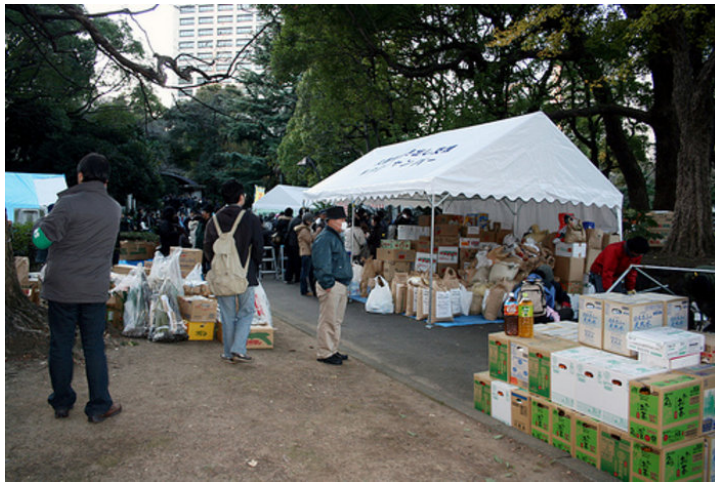
Supplies for Hakenmura

The idea for this village emerged from a discussion in December 2008 at a bar in Tokyo among activists and lawyers who had been helping unemployed dispatch workers. These activists organized an executive committee to prepare the village, which opened at Hibiya Park, Tokyo's relatively small "Central Park," over the week from December 31st to January 5th (at which date public offices for the unemployed were supposed to open). The organizers distributed food and lodging, provided counseling and employment consulting services, and helped the residents apply for welfare benefits. The residents pitched tents for their lodgings, but the space was cramped and it was hard to sleep with nighttime temperatures around the freezing point.