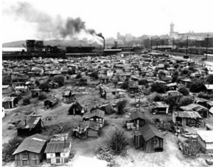
An American depression: Hooverville