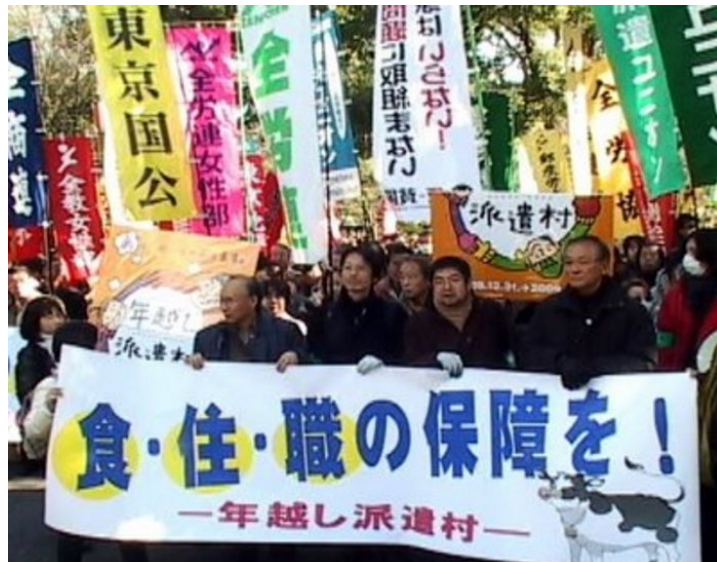
Hakenmura residents march to the Diet on January 5, 2009 demanding food, housing and jobs

In Japan, the week or so from the end of December through the first days of the New Year constitute the longest and most solemn holiday of the year. Mainstream newspapers and TV news programs during this week are typically filled with mundane reports of the events of the season. But the week bridging 2008 to 2009 was distinctively different. Each day, the newspapers, TV news programs, and even websites such as Yahoo carried reports—often as the top story with frequent updates—of a unique camp supplying food, beds, health checks, and even spiritual support to jobless and homeless people gathered in the center of downtown Tokyo. This news drew an unexpectedly wide range of attention and generated unprecedented reactions, and its drama symbolized the recent suffering of Japanese workers and their families, especially "the working poor." The entire episode suggests there has been a turning of the tide in Japanese labor politics.