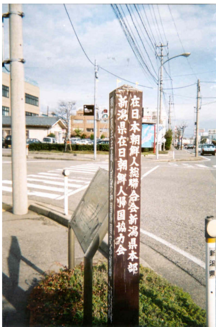
Repatriation memorial, Niigata

The other two steps relate specifically to Japan’s role in receiving North Korean emigrants. The information now available on the 1959-1984 repatriation makes it clear that the Japanese government, together with the North Korea government, has a deep moral responsibility to address the problems of those who migrated from Japan to the DPRK. The most obvious way to fulfill this responsibility is to make an explicit official commitment that Japan will accept all those former “returnees” and their immediate family who wish to resettle in Japan. This commitment should include provision of permanent residence rights to those who do not have Japanese citizenship, as well as measures to ensure that repatriate-refugees have access to government-supported welfare, language classes, skill-training and counseling services. All other North Korean refugees who arrive on Japan’s shores should have their claims for asylum assessed under the rules of the Geneva Convention.