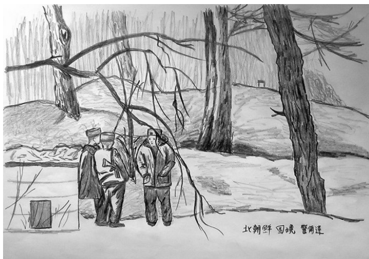
Border guards. Picture of the North Korean border drawn by a refugee

able to encompass and respond to this diversity. Surely the last thing that the repatriate-refugees need is to become the test-case in yet another scheme for nationalist social engineering.