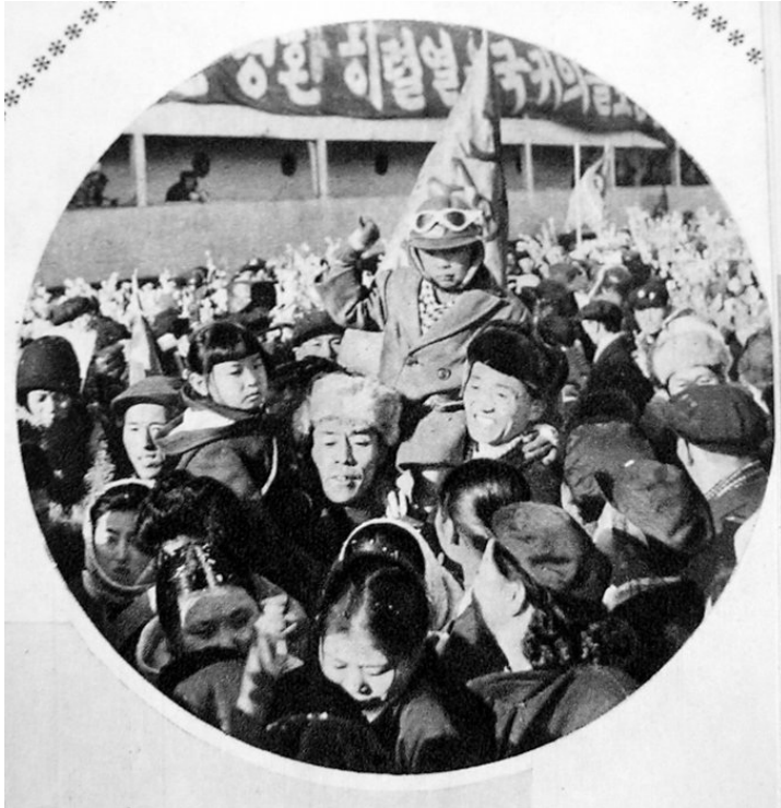
Repatriates arriving in Cheongjin

At 4 o'clock in the morning on 2 June 2007, a man out fishing near the port of Fukaura in Japan's Aomori Prefecture came upon a small boat with four people in it. The boat had left the North Korean port of Cheongjin one week earlier, and the people on board – a couple and their two adult sons – were North Korean refugees. [1] They were the first to appear on Japan's shores by boat since 1987, when eleven refugees from North Korea had arrived in Fukui on a boat called the Zu Dan 9082. The events in the sleepy little town of Fukaura briefly became headline news in Japan, igniting media debate about a possible impending influx of displaced people from the Korean Peninsula, and about the appropriate Japanese response to the North Korean refugee problem.