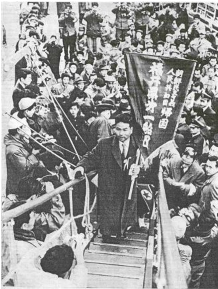
"To our dear fatherland!" The first one comes up the gangway