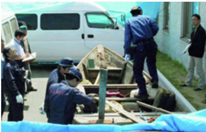
Fukaura police examine boat that contained North Korean refugees

The four refugees told Japanese authorities that they had been heading from Cheongjin to Niigata (a route which, as we shall see, has interesting historical resonances), but had been carried north to the coast of Aomori Prefecture by the currents. However, even though their intended landfall had been Niigata, they were apparently not seeking asylum in Japan, but were instead asking to be resettled in South Korea.[2] After a brief detention in Japan, and a flurry of negotiations between the Japanese and South Korean governments, on 16 June the four refugees were shipped out of Japan to South Korea[3], and Japanese public interest in the incident subsided.