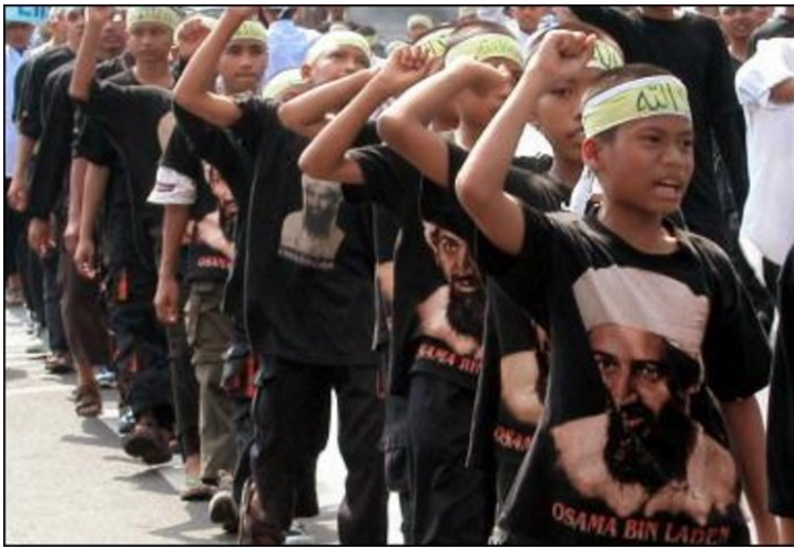
Muslim demonstrators in Setia (World Divided)

One of the victims, Ema, recalled: "They attacked the male dormitory first and later the female dormitory. They shouted from the mosque: "Jihad, Allahu Akbar, attack, kill them, burn them! The attackers used stones and firebombs and they even had guns. They were screaming: 'Go get their people. Fight for your religion.' And the crowd was responding: 'Jihad! Let's fry them – let's make satay from them!'" remembered Entris, another victim of the attack.