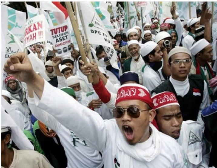
FPI rally on August 27.

In June 2008, members of the radical Islamic Defenders Front (FPI) attacked secularists who were commemorating the 63rd year of Sukarno's relatively tolerant Pancasila state ideology at the National Monument (Monas) in central Jakarta, leaving at least 70 people injured. Activists were brutally beaten and police refused to intervene. More than 1,000 officers stood by and watched the violence. FPI, wearing long white robes not unlike those of the KKK, regularly attack bars, cafes and pork-selling establishments and other "haram" establishments with the state either indirectly supporting their actions or not daring to intervene.