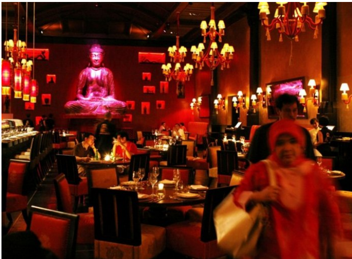
Buddha Bar

While the Muslim majority is extremely protective of its symbolism, particularly anything connected to the prophet, hundreds of churches have been attacked, forcing Catholics and Protestants to pray in rented halls in shopping malls or hotels. In early March 2009, Buddhist youth demonstrated and blocked the entrance to a newly opened "Buddha Bar" associated with the Buddha Bar in Paris and New York, for violating their religious sensitivities. The bar opened in the old Dutch-built cultural center that in colonial days had exhibited works by Chagall and Picasso exhibited in colonial days and is now privatized. In this instance, the students succeeded in closing the bar, demanding that the name be changed.