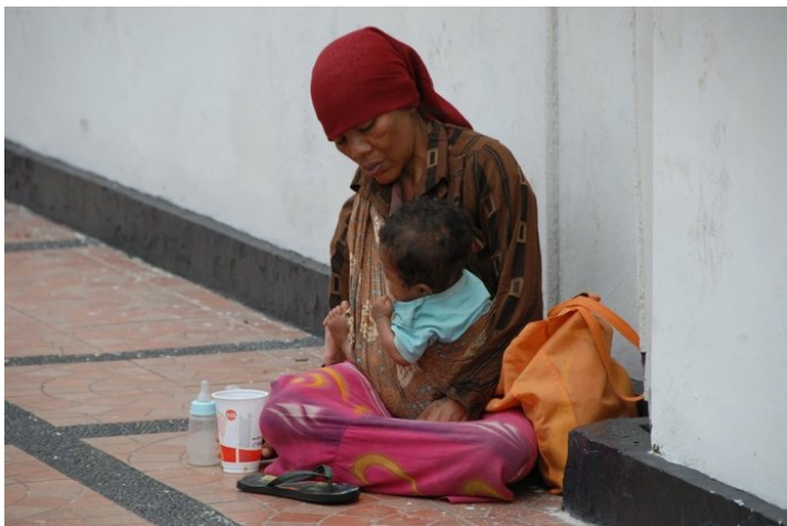
Poverty in Jakarta

There is hardly any place in the world where the difference between rich and poor is be more extreme than Indonesia. Jakarta is a city of luxury hotels and malls, with children playing in open sewers nearby. By the international poverty standard of $2 dollars a day, more than half the population of Indonesia is poor.