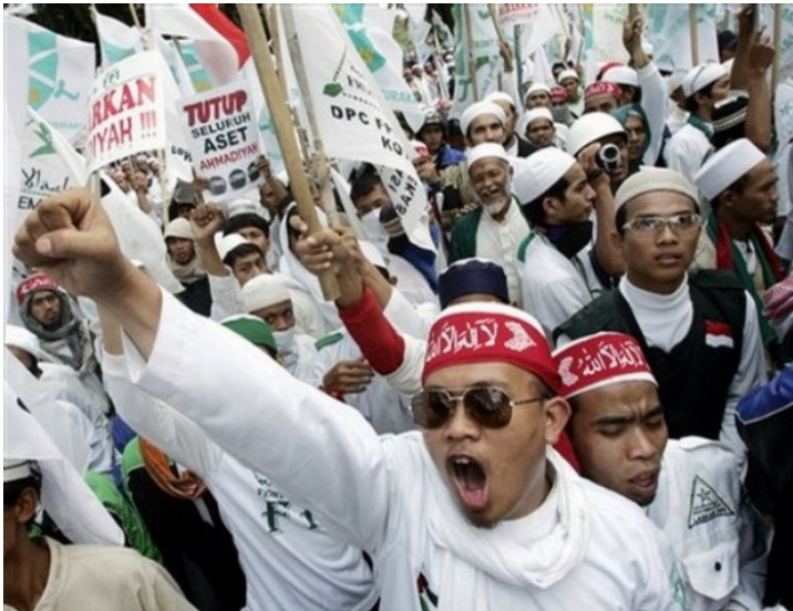
FPI rally on August 27.

In June 2008, members of the radical Islamic Defenders Front (FPI) attacked secularists who were commemorating the 63rd year of Sukarno's relatively tolerant Pancasila state ideology at the National Monument (Monas) in central Jakarta, leaving at least 70 people injured. Activists were brutally beaten and police refused to intervene. More than 1,000 officers stood by and watched the violence. FPI, wearing long white robes not unlike those of the KKK, regularly attack bars, cafes and pork-selling establishments and other "haram" establishments with the state either indirectly supporting their actions or not daring to intervene.