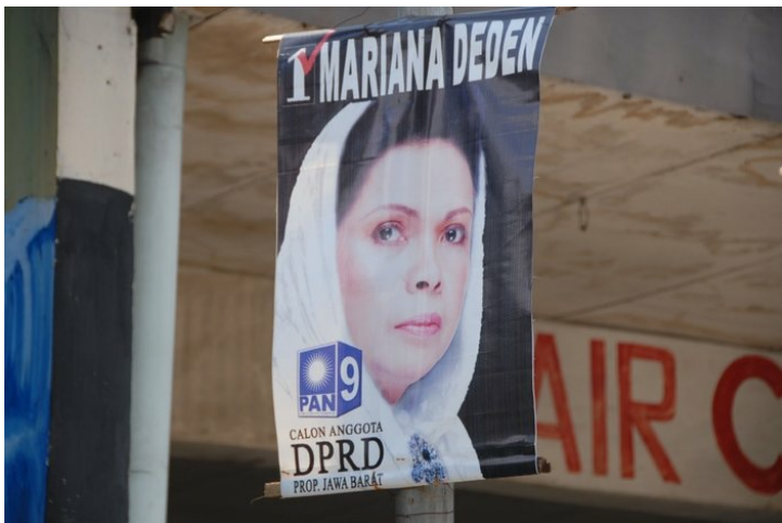
Poster for a female candidate

democratic Islam has deep roots in Indonesian society, but it has nothing to do with the present administration,” he says, zeroing in on a specific piece of legislation to secure women’s rights the government has failed to back. “Right now Susilo Bambang Yudhoyono is not willing to even issue a government decree introducing affirmative action for women in parliament, a plan that would set aside 30% seats in the Parliament for women. The hard work of all those who fought for this goes to waste.”