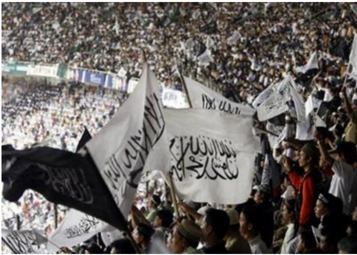
Caliphate rally at Bung Karno Stadium (press photo).

"There is nothing we can do to stop this", said Ditasari a political leader and former head of PRD, the only progressive opposition party to emerge during the so-called reformation period that followed the 1965 military coup. "Indonesia has been hijacked by Islamists and religion is in full control over society. We can't reverse the process. We can only slow it down to some degree. You can't say that you don't believe in God, anymore. For years atheists were compared to Marxists and Marxists were a legitimate target. This Presidency is the worst that could have happened to Indonesia", commented Ditasari. The government is too weak to confront religious extremism, corruption and other major problems that Indonesia is facing. Yudhoyono is not willing to take decisive action to defend the constitution."