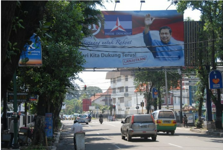
Yudhoyono, a former Suharto general now president of Indonesia

Hillary Clinton had nothing but praise for Indonesia on her Feb 18-19 visit. She came to Indonesia as the new Secretary of State and she came, she said, as a friend. Hilary Clinton met Indonesian President Susilo Bambang Yudhoyono and later told the press that she "wanted Jakarta's advice and counsel about how to reach out not only to the Muslim world but to Asia and beyond."