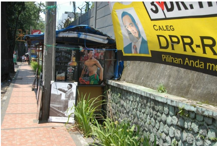
Indonesia heroes on display: Adolph Hitler (a new best seller), Jim Beam and Ronaldo

That is, of course, music to the ears of the Indonesian political establishment, religious leaders, and the majority of Indonesians. It couldn't be further from the truth.