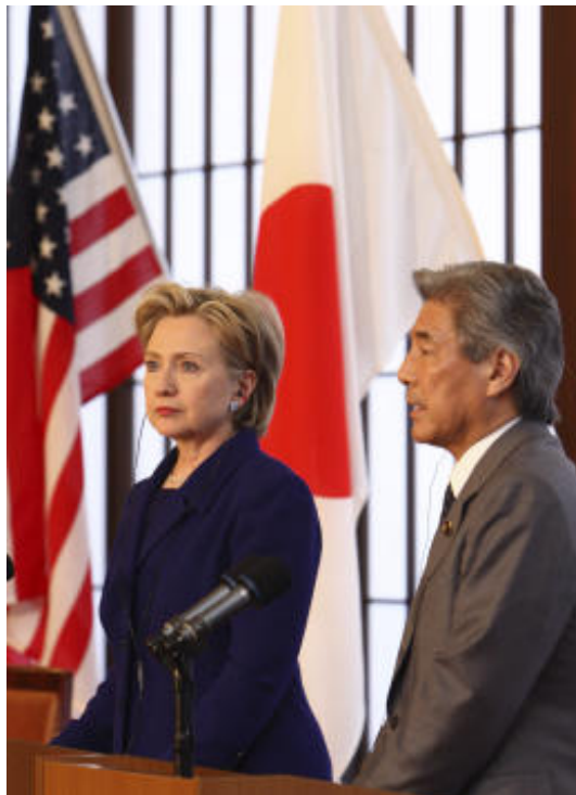
Clinton and Nakasone

It was to the capital of this crumbling kingdom that Hillary Clinton flew in on 16 February, on her first mission as Secretary of State of the new Obama administration. The following day, she and Japanese Foreign Minister Nakasone Hirofumi (son of former Prime Minister Nakasone Yasuhiro - as in 18 th century England, most Japanese political leaders have inherited their positions, and are second, third, or fourth generation politicians of what in England used to be called "rotten" or "pocket" boroughs) signed an Agreement, nominally on the transfer of Marines from Okinawa to Guam.