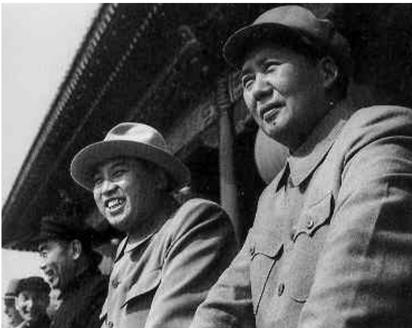
Kim Il-Sung and Mao in October 1964

weapons. In a letter to Mao Zedong, he declared that China and North Korea, as brother countries who shared fighting and dying on the battlefield, should share the atomic secret. But Mao turned down the North Korean request on the grounds that a small country like North Korea did not need nuclear weapons.