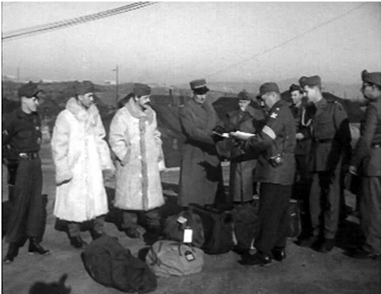
Swiss members of the NNSC depart for Korea, 1954