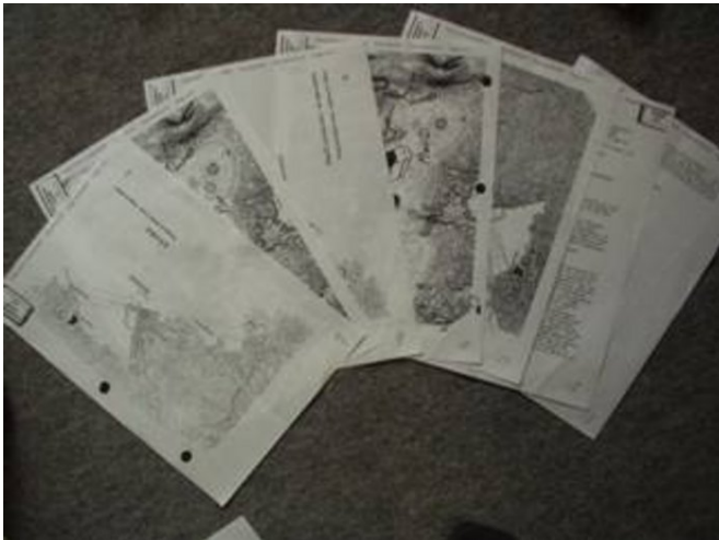
DoD court documents