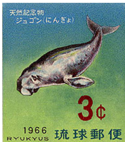
Ryukyu Postal's stamp to commemorate the dugong's designation as a natural monument in 1966

avoid tsunami or as a creature who taught human beings how to procreate, have been passed on from generation to generation. Rituals portraying the dugong as a messenger of the Sea God are still performed in some communities.[73] It is these historical and cultural aspects of the dugong that define the dugong as a "natural monument" in Japan and that brought about the dugong lawsuit in the first place.