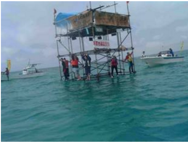
Anti-base construction protesters in Henoko in 2004

In May 2006, after withdrawing the offshore plan,[20] the Japanese and US governments proposed a new “coastal” plan, now in the framework of the US-Japan Roadmap for Realignment Implementation.[21] The new plan was to construct a military airport with two runways in a V-shape in Cape Henoko and the adjacent water areas of Henoko and Oura Bays. The Japanese government swiftly obtained agreement on the coastal plan from both the Okinawa prefectural government and Nago city on general terms. The issue of the exact location of the airport was, however, left unsettled and remains so today.[22]