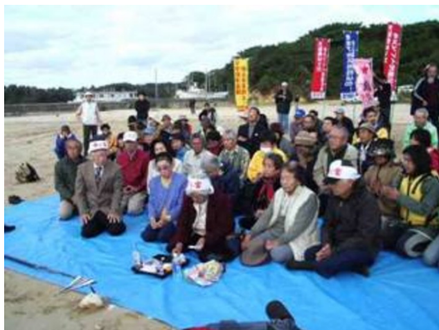
Praying to the sea god is an integral part of the anti-base construction movement