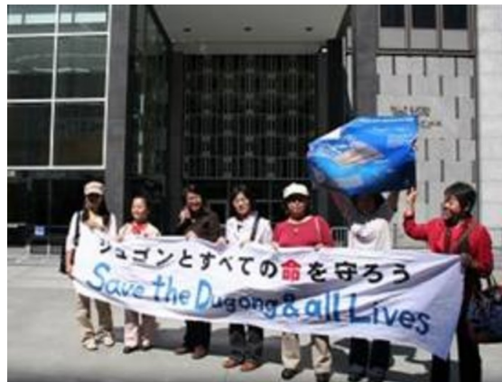
Dugong supporters in front of US court building