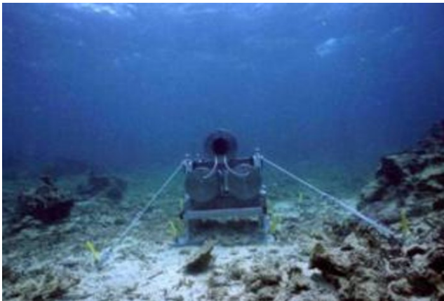
Video-camera set up in the dugong’s pathway

In May 2007, the Japanese government began “preliminary surveys” to collect “basic data” on the environment of the Henoko and Oura areas before officially beginning its EIA process. Anti-construction activists and environmentalists denounced the surveys, arguing that incorporating the results of the preliminary surveys into the yet-to-be-began EIA process was against the EIA law.[23] They also criticized some of the methods used in the surveys as scientifically unproven and harmful to the dugongs and the environment.[24] Some anti-construction activists launched sit-ins on the ground and waters of Henoko and Oura Bays.