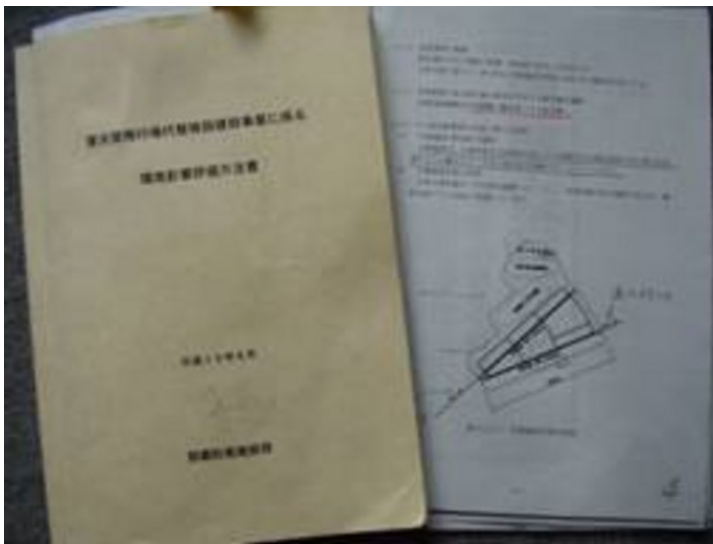
The scoping document showing a crude outline of the airport