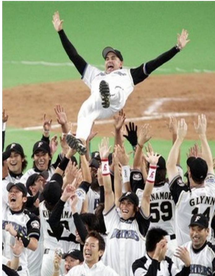
ICCND October, 2008 meeting

The issue of nuclear war and nuclear disarmament have repeatedly been submerged in recent years by issues of terrorist attack and wars such as those in the Congo, Rwanda, Afghanistan, Iraq and Gaza. But as former Foreign Minister Gareth Evans recently pointed out at the October meeting of the Australia-Japan International Conference on Non-Proliferation and Disarmament, "The truth of the matter is that there are at the moment, depending on how you calculate these things, somewhere between 13,000 and 16,000 nuclear warheads actively deployed, a great many of them still on hair-trigger alert even though the Cold War has been long over. And between them having a phenomenal destructive capability. The reality also is that we are on the brink - after years and years of containing rather well the emergence of new nuclear weapon states, with all the risks of either deliberate or accidental use of nuclear weapons that flows from the existence of nuclear weapons or nuclear arms proliferation . . ."