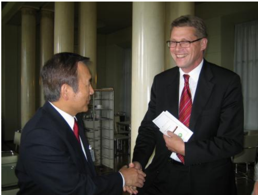
Hiroshima Mayor Akiba Tadatoshi with Prime Minister of Finland promoting Peace 2020

Moreover, the comments made by MOFA at the Christmas Eve meeting were consistent with existing efforts to eliminate nuclear weapons, such as the Mayors for Peace 2020 Vision, an initiative supported by 236 cities in 134 countries and regions of the world to abolish all nuclear weapons. MOFA's comments also reflected the Japanese government's recognition of the legitimacy of the Article VI of the Nuclear Non-proliferation Treaty that calls for complete nuclear disarmament. Speaking for herself, Ms. Kawaguchi criticized the nuclear deal recently struck between the United States and India.