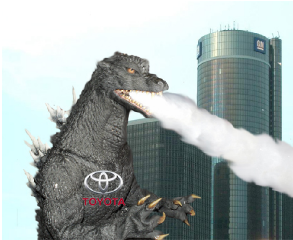
Godzilla Toyota attacks GM