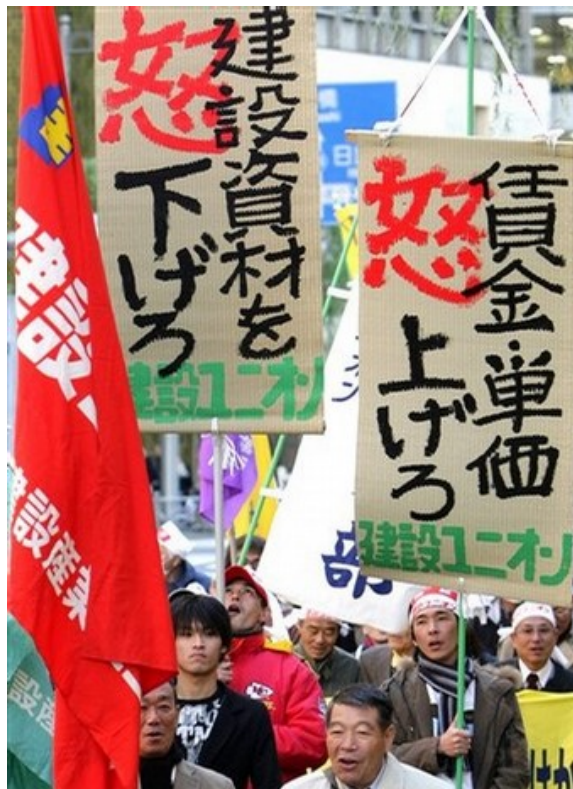
6,000 construction workers demand higher wages on Nov. 20, 2008 as Japanese exports plummeted in October.

Japanese exports declined 7.7% from a year earlier in October, the worst fall since December 2001. Japan's trade surplus with the US fell 27.5% to 519.2 billion yen, down for the 14th straight month, while the trade surplus with the European Union fell 24.8% to 357.4 billion yen, down for the second month in a row.