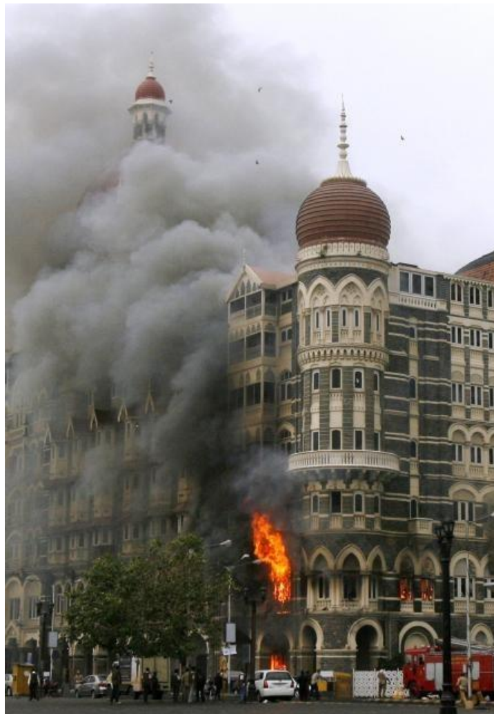
The Taj Mahal Hotel in flames

However, after the initial shock of the Mumbai attack wore off in Pakistan—and the international narrative that the attackers were Pakistani coalesced—there was an immediate and emotional rejection of the idea that long-suffering Pakistan should be further destabilized under U.S. and Indian insistence that the miscreants be pursued inside Pakistan's borders.