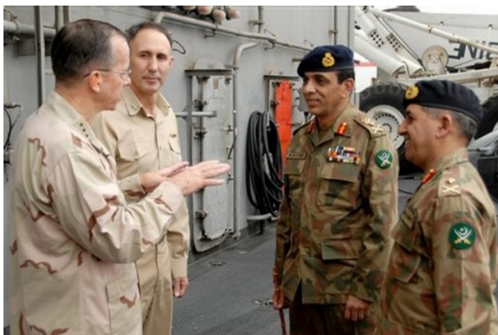
ISI head Maj. Gen. Ahmad Shuja Pasha (right) with Chairman of the US Joint Chiefs of Staff, Adm. Mike Mullen (left) in an August 27, 2008 meeting.