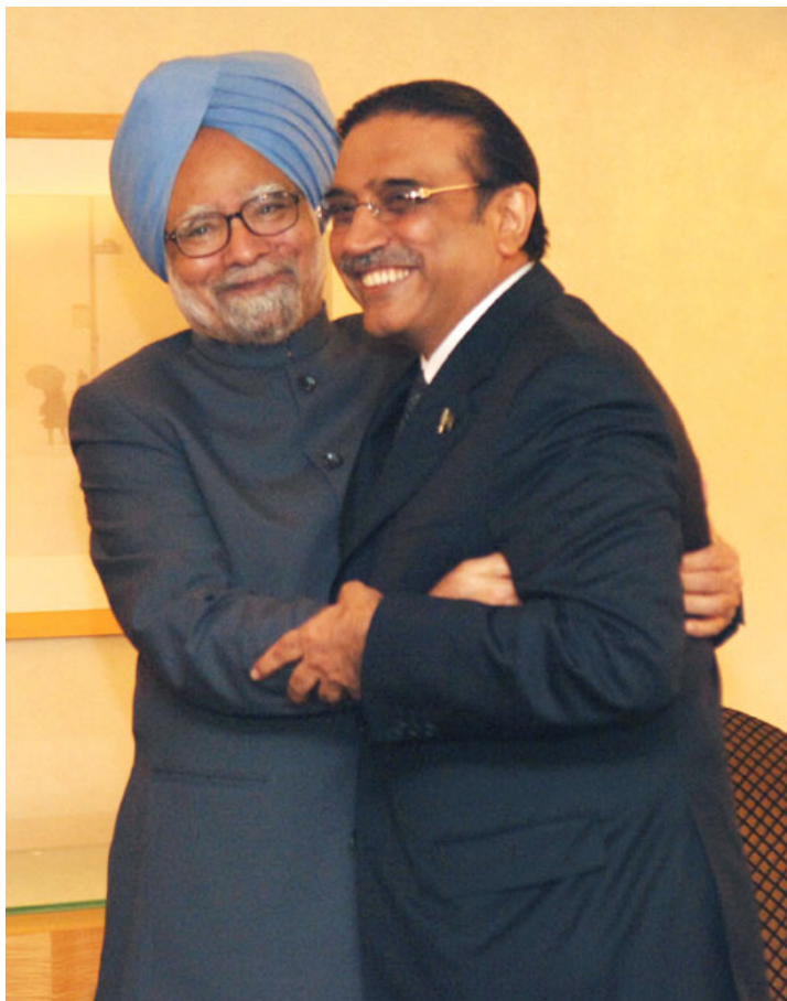
Manmohan and Zardari

First, there was a bizarre kaffuffle over an allegedly threatening call from India's Foreign Minister, Pranab Mukherjee, to President Zardari, demanding action on the anti-terrorist agenda "within 48 hours". Secretary Rice tried to defuse the situation by passing the message to Pakistan that the phone call was a hoax.