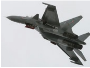
Russian-built Sukhoi Su30 aircraft, a mainstay of the Indian air force

The agreement is a concern for China, as it would be for any nation whose traditional regional adversaries talk about cooperation, adds Weedon. "Most countries still see the national security angle of space as a unilateral effort and are unlikely to collaborate in that area. They will, however collaborate in scientific or civilian areas."