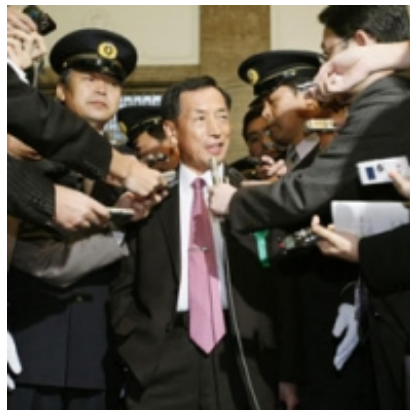
Gen. Tamogami enjoying the spotlight following his dismissal

By early November 2008, every major newspaper and mainstream television station in Japan had reported on the events surrounding Air Self-Defense Force Chief of Staff Gen. Tamogami Toshio: his dismissal from the Defense Ministry for provocatively contradicting national policy on the Asia-Pacific War and his later unrepentant testimony before a committee of the National Diet.