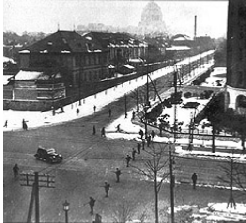
Japan's foreign ministry surrounded by military mutineers in 1936

Reacting against this “sleaze,” the military led attempted coups on May 15, 1932 and on February 26, 1936.