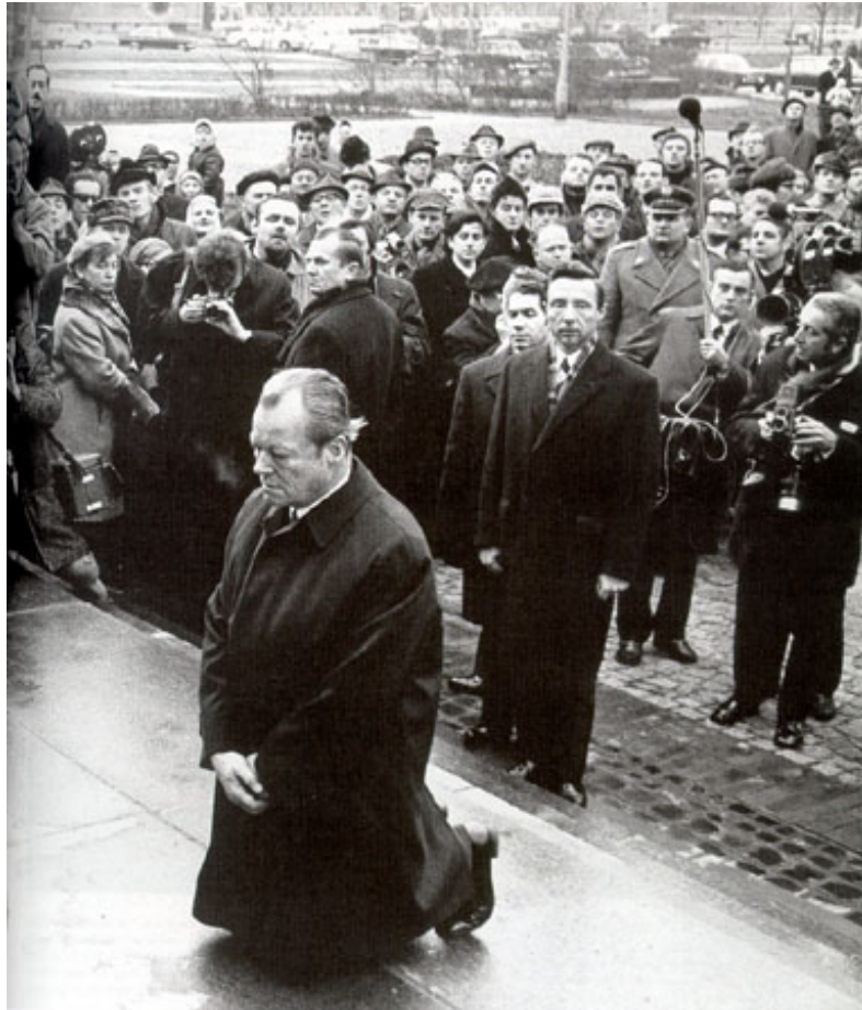
Willy Brandt at Warsaw, 1970

intentions. The great irony is that well-meaning efforts to soothe relations between former enemies can actually inflame them.