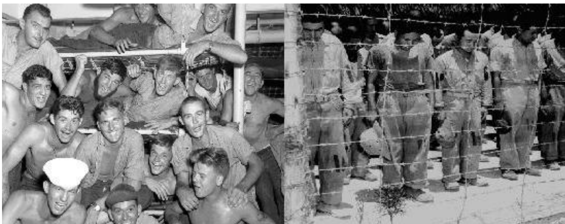
How will their countries remember them? How will their adversaries remember them? Left, American GIs

Why might apologies matter in international politics—that is, why are they not merely dismissed as “cheap talk”? Apologies—or more broadly, national remembrance—matter because the way countries represent their pasts conveys information about foreign policy intentions. As countries remember, they define their heroes and villains, delineate the lines of acceptable foreign policy, and send signals about their future behavior.