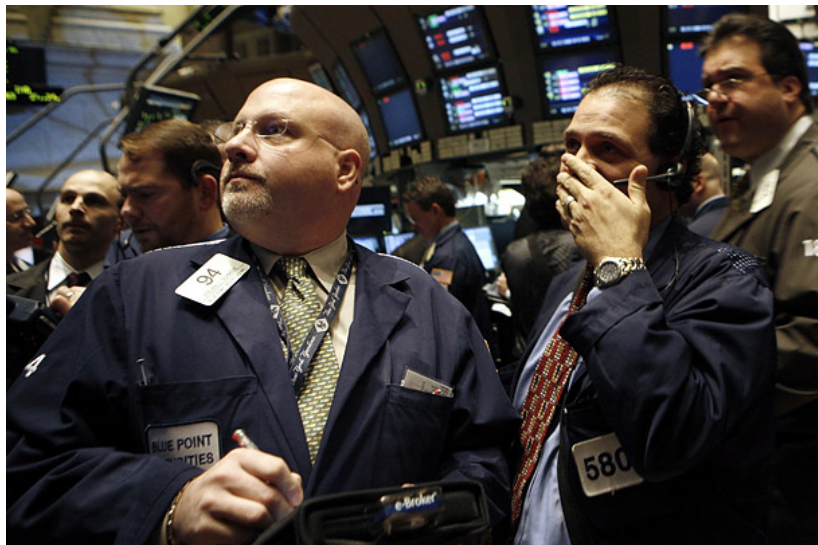
The stock market in free fall in October-November, 2008

For those Americans who are not daily readers of the Financial Times, the past few months have been a crash course in the abstract and obscure instruments and arrangements that have derailed the nation's economy. From mortgage-backed securities to credit default swaps, the financial health of the country has undergone a gory public dissection. And yet, as Barack Obama prepares to take office, one particularly frightening problem has escaped public notice; indeed, it may not even make the agenda of the global summit being held this weekend, dubbed "Bretton Woods II" after the postwar system of currency controls. The international monetary system is in big trouble.