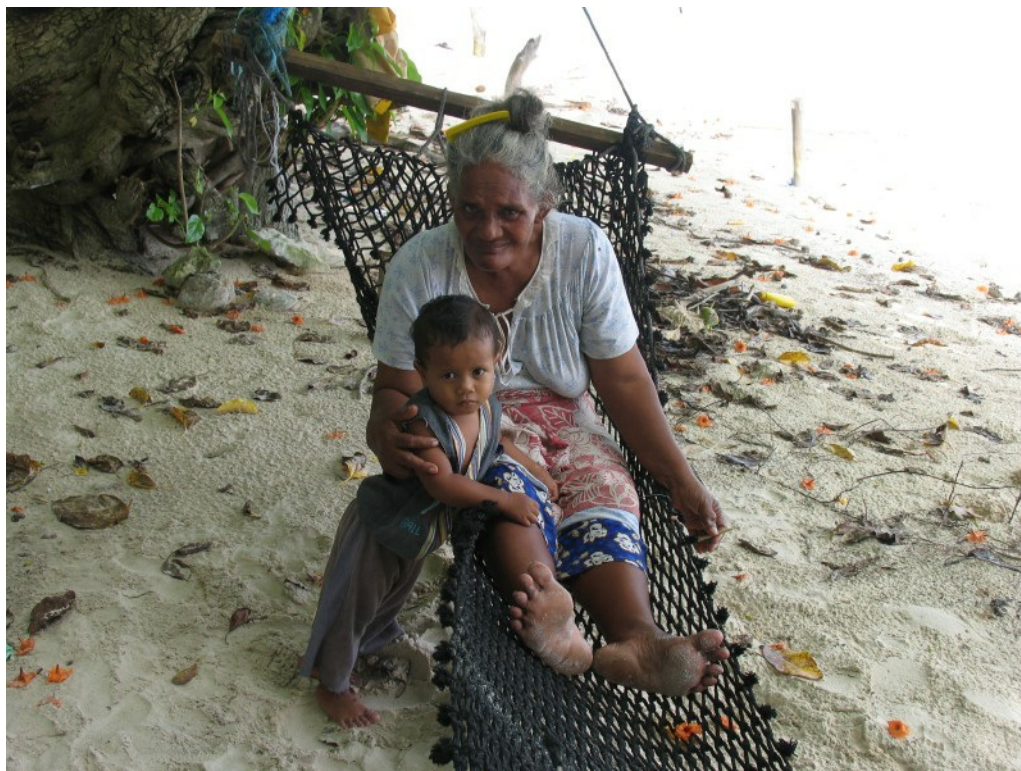
Funafulu. Only the very old and

It is obvious that the problem is becoming increasingly severe. The Pacific islands are losing people. Environmental refugees are pouring out of Tuvalu, which may be the first country to become uninhabitable due to rising sea level from global warming. Kiribati is facing similar problems, plus overpopulation and social malaise. And the same can be said of the Republic of the Marshall Islands (RMI) with some of the worst ecological and demographic problems anywhere in the world (mainly as a result of the US nuclear experiments and present day missile range on Kwajalein Atoll).