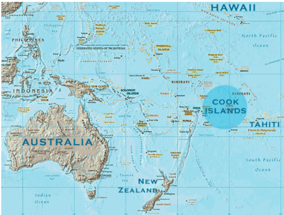
Cook Islands map

With all that beauty, one would expect an enormous influx of foreigners searching for sun and sea, and a local demographic explosion to serve them. But the opposite is true: the Cook Islands are losing people at an alarming rate. And despite the arrival of desperate migrant workers from Fiji, the Philippines and elsewhere (almost 300 were given permanent residency status this year), the total number of people living here is declining at alarming rates. According to estimates of the "CIA World Factbook – Cook Islands," the population fell to 12,271 in 2008. Some older statistics that still circulation claim a total population of the Cook Islands of 18,700, of which 10,000 to 12,000 live in Rarotonga.