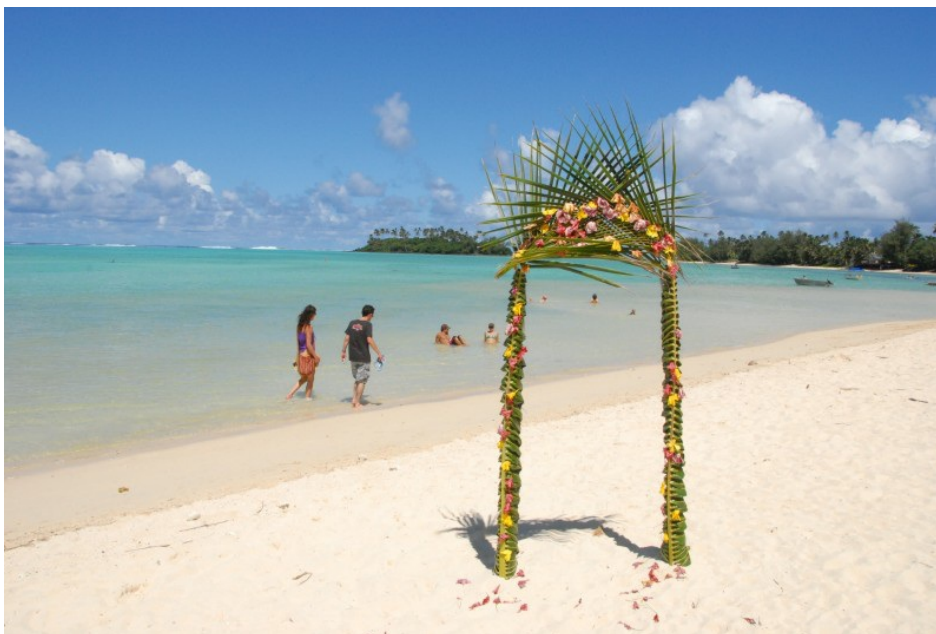
Muri Beach, Rarotonga

Welcome to Rarotonga – the main island of “Cooks”, a country spanning a huge expanse of the Western Pacific, but with a combined land mass of just 236.7 sq kms. “Raro” may be the main island of the country, but its coastal road runs only a bit over 31km.