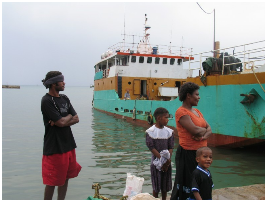
Lautoka port Fijian internal migrants in

“The Cook Islands are one of the best performing countries in the Pacific”, explains Elisabeth Wright-Koteka, Director of the Central Policy and Planning Office of the Prime Minister. “Our people want the same standards as New Zealand. But we do not have enough resources to satisfy them. Independence was both blessing and curse. Blessing: because we have our own country and we have freedom of movement, which is guaranteed by the fact that all of us are in possession of New Zealand passports. Without it, we would be just another Tarawa (in Kiribati) – overpopulated, stuffed and desperate. Curse: because now we don’t have enough people and we have to import workers from the Philippines and Fiji and even that is not enough to fill the gap.”