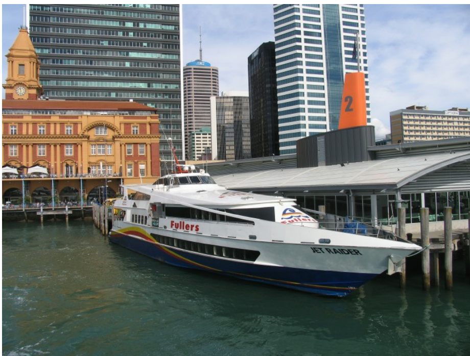
Auckland, a promised land for many Cook

There are now 60,000 Cook Islanders living in New Zealand alone. The total population of the Cook Islands is only around 18,700, of which 10-12,000 live in Rarotonga.