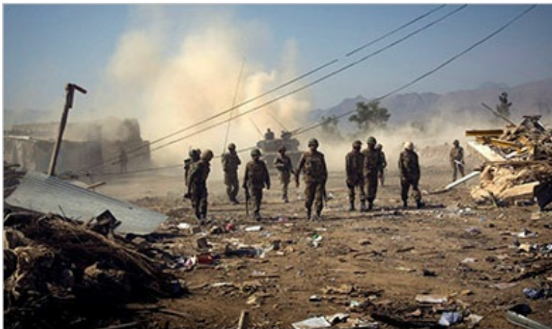
Pakistan soldiers in Bajaur tribal region, November 2008

Some observers with long memories of the maneuvering of previous US administrations to extricate themselves from disastrous interventions pointed to the curious conjunction of these signals of an interest in negotiations accompanying a drive into Northwestern Pakistan and continuing bombings in both southern and northeastern Afghanistan. China Hand for example, the author of the blog China Matters, recalled the political cover for his plan to withdraw from Vietnam that President Richard Nixon achieved by escalating bombing of North Vietnam.[43]