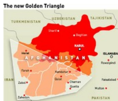
The new golden triangle. Afghan opium production

In reality, far from this war being fought to prevent Afghanistan becoming a narco-state, it is a war that protects the beneficiaries of the narco-state that has already emerged. Apart from a small recent dip attributable to bad weather, opium production continues to expand, feeding the budgets of both sides of the conflict. While the Taliban government in the years just before its fall banned opium production, Islamist groups, as well as government figures (including those close to the president, such as his brother-in-law[19]) now embrace expanded opium production and heroin export. The "farm-gate" value of the opium harvest is now estimated to amount to about 13% of GDP, with about half a million households now dependent on opium production, under economic and security conditions that offer little alternative for survival.[20] Eradication policies worsen the situation, and many "drug-policy" programs simply serve to enrich a fabulously corrupt few and impoverish many.[21]