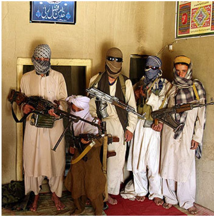
Taliban fighters.

This shorthand summary of an extremely complex political and military situation is taking place in a country larger than Iraq, with a bigger population, a far poorer economic base, and a more complex ethnic formation.[17]