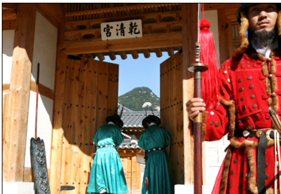
The Geoncheonggung Residence in the Gyeongbok Palace, the site of the murder of Empress Myeonseong, was reopened in 2007 for the first time in 98 years

Indeed, for half a century, Japan fought once or more than once with all neighboring countries to the West, North and East. Japan was always the attacker, and in the majority of cases, Japan was the aggressor. Those who were attacked and invaded were left with ineradicable scars and indelible pain. The murder of empress Myeonseong, the Port Arthur Incident and Tsushima Incident, and the Eulsa Treaty of 1905 making Korea a Japanese protectorate, Japan's repression of the March 1, 1919 Korean movement, the Marco Polo Bridge Incident in China in 1937, the Nanjing Massacre, and the Comfort Women, Pearl Harbor—these can never be forgotten.