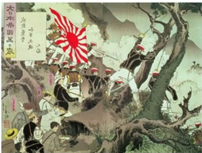
The First Sino-Japanese War fought in Korea in a contemporary Japanese woodblock print

The first fifty years of the eighty-year period was characterized by Japanese wars. The Sino-Japanese War of 1894-5, from the perspective of the issues contested and the battlefield can be called the first Korean War. Japan launched the Russo-Japanese War that followed in 1905 in order to force Russia to recognize Japanese rule of Korea. As a result of the war, Japan succeeded in making Korea a protectorate, then annexed it, and finally colonized it. In China, from the Manchurian Incident of 1931, Japan made war in China and elsewhere for fifteen years. Japan fought Russia in the Siberian War of 1918 with the dispatch of soldiers, again in the Nomonhon Incident of 1939, and then in the Russo-Japanese War in August 1945. With the US, Japan fought the 'Greater East Asia War.'