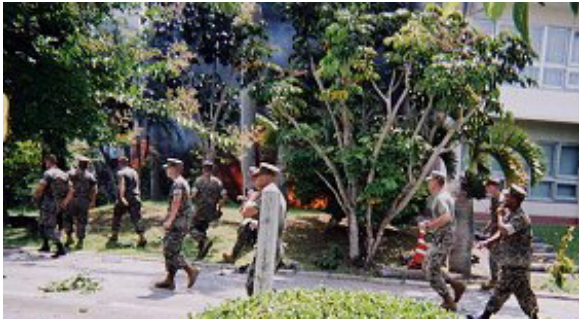
Marines occupy Okinawa International University campus

The incident is telling as to how the US military understands its status in foreign countries. That is, it will obey the status of forces agreements when it's no big inconvenience, but in the case of a crisis, it will operate at will.