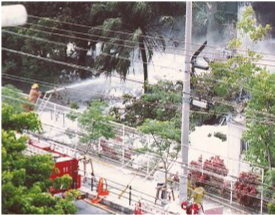
Okinawan City firefighters on the scene

Immediately, scores of Marines came pouring over the fence (the base and the university are back-to-back), and occupied the university. They set up a cordon of yellow tape around the accident site, and kicked out not only reporters and cameramen, but also the Okinawan firemen who had come to put out the blaze, the local police who had come to investigate the cause of the accident, and even the mayor of the town.