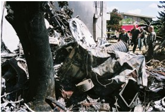
Marines inspect wreckage at the site of the crash

That evening a friend drove me through some backstreets, avoiding roadblocks, and we managed to get into the university, as far as the yellow tape blockade. Standing behind the tape was a line of Marine MPs, pistols on their belts. Behind them, Marines were dismantling the wrecked helicopter and loading it into trucks (from a police standpoint, destroying the evidence).