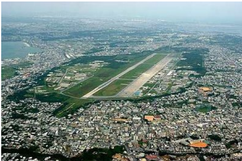
Futenma base in the middle of Ginowan City

The Okinawa experience brings into focus the humiliation of this extraterritoriality, but a recent incident here raises another question: When push comes to shove, to what extent is the US military willing to abide by even its own agreements?