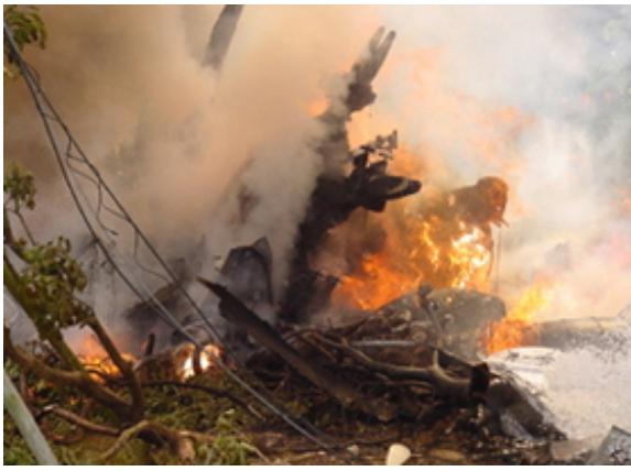
CH-53 in flames

Immediately, scores of Marines came pouring over the fence (the base and the university are back-to-back), and occupied the university. They set up a cordon of yellow tape around the accident site, and kicked out not only reporters and cameramen, but also the Okinawan firemen who had come to put out the blaze, the local police who had come to investigate the cause of the accident, and even the mayor of the town.