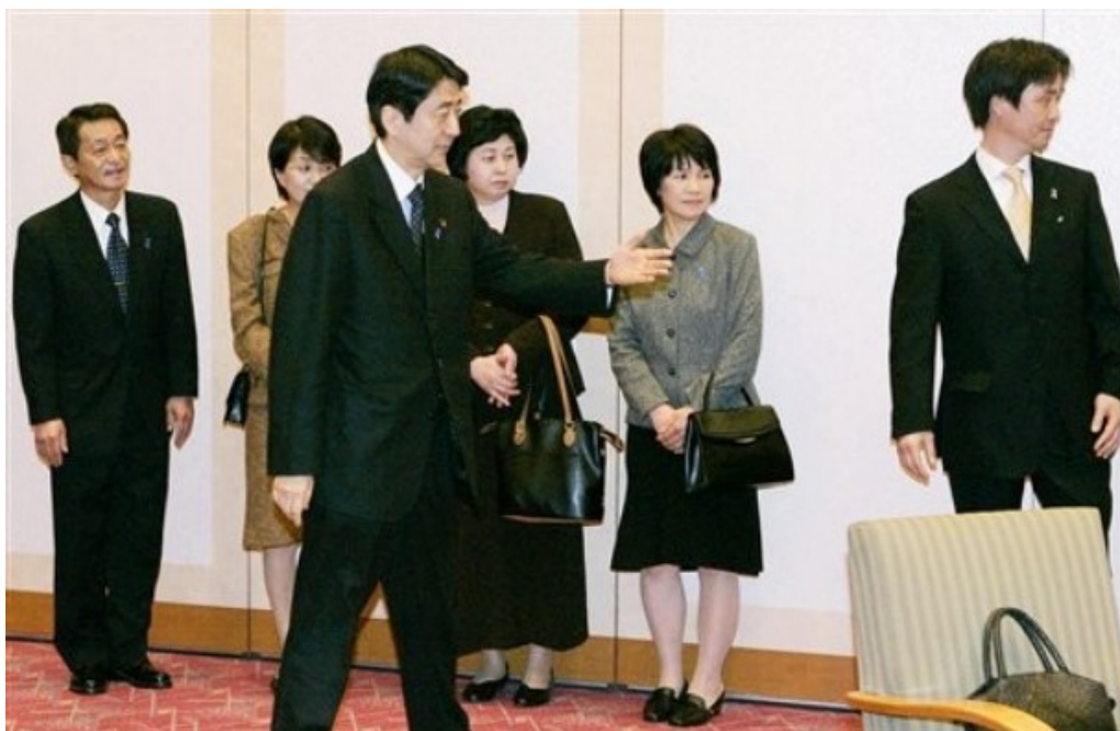
Abe and five abductees who were returned to Japan. February 25, 2007

Clearly, the single-issue politics served Abe well. By making normalization conditional to progress in the abductees issue, Japan simultaneously secured greater international interest and maintained a powerful tool to punish North Korea for lack of progress. Some may conclude that narrow domestic political interests simply prevailed over broader strategic purposes. At a deeper level, however, Abe's policy may be thought of as a conscious attempt to set the bilateral and multilateral political agenda in a context that is framed by a North Korean regime first and foremost interested in negotiating with Washington. Tokyo is generally relegated to the sidelines, expected to provide economic assistance when time is ripe. With little to lose bilaterally and lots to gain domestically and strategically, Abe insisted on this one issue. An obstructing stance furthermore assures that multilateral engagement does not move too fast without real concessions from Pyongyang.