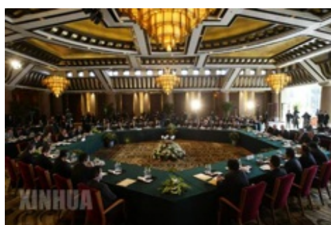
The Six-Party Talks negotiating table (entrance behind PRC seat).

From a security perspective, Japan's concerns over North Korea's nuclear and missile programmes appear to be at odds with its (in)action in negotiations addressing these issues. When taking a closer look, however, it becomes apparent that while Tokyo recognizes Pyongyang as the greatest threat to Japan's national security, Pyongyang provides also a welcome justification to the Japanese government for the enhancement of Japan's security capabilities. The North Korean threat creates leeway to pursue a more proactive military policy and create more offensive capabilities for broader (collective) defense purposes. The abductee issue serves to give the North Korean threat a human face domestically.