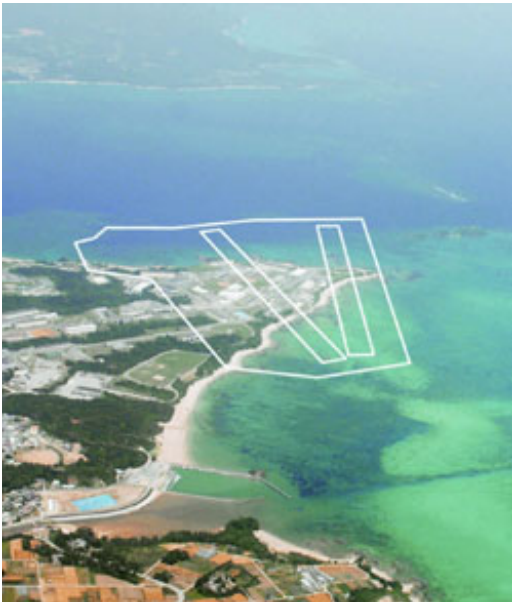
US plans for the Henoko Base runway

Recently, instead of seeking the informed consent that a democratic society demands, governments have sought instead to gain formal consent, by fiscal manipulation that combines incentives and threats. It is a stratagem developed over the past decade by the bureaucrats at the helm of the nation state to impose their base project on Nago City. Since Nago opposition to the new Henoko Base was plain, and the formal consent of local self-governing bodies was necessary, money was poured in to secure it under the 10 year, 10 billion yen per year, "Northern Districts Development" policy adopted in 1999.