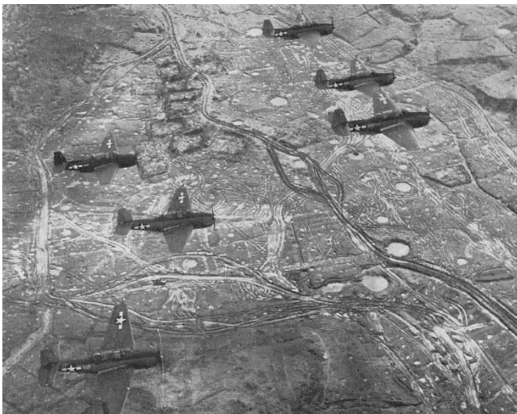
US planes over Southern