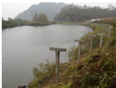
Dandong. Barbed wire fence separates China from North Korea (left)