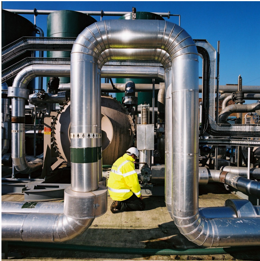
Anglian water framework

On the other hand, there are many investment trusts that invest in several private sector water companies and a number of companies that supply water treatment technology and equipment, many of them with commodities that see the standard price increase several times in a few years and commodities that realize unparalleled high dividends.