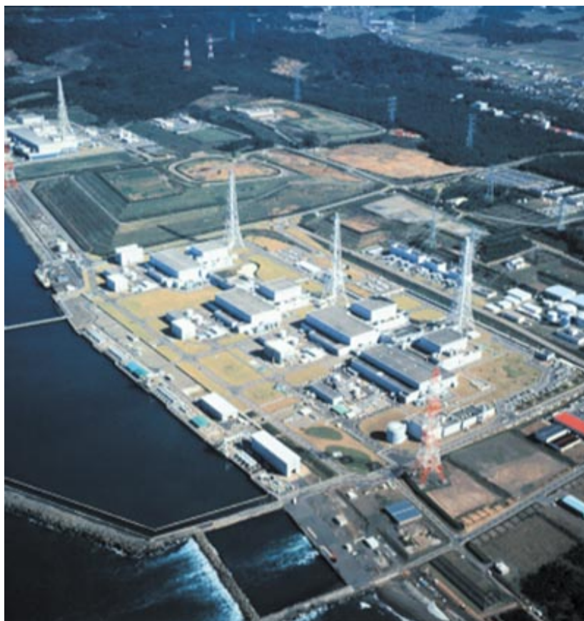
Kashiwazaki, since 1997 the world's largest nuclear power plant

The nuclear-first strategy has also survived a series of deadly blunders, including an accident at the Mihama Nuclear Power Plant in Fukui Prefecture two years ago that killed four, and the discovery last year of an earthquake fault close to the world's largest nuclear-power complex in Kashiwazaki-Kariwa. The complex remains closed.