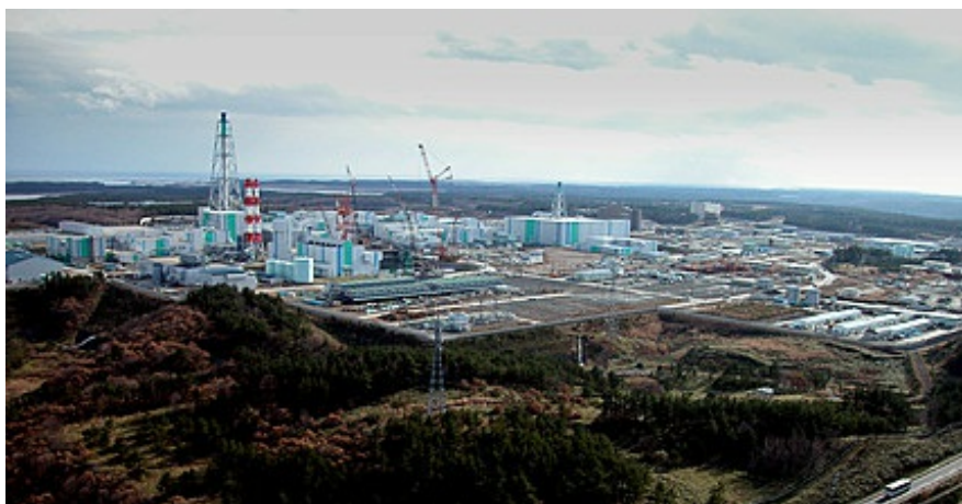
RokkashÅ nuclear processing plant

These schemes are being fiercely resisted. Over 810,000 people, for example, have signed a petition demanding a ban on radioactive releases from RokkashÅ. But such criticism, and the decision of some countries such as Germany to scrap nuclear energy will not affect Japan's march to the future, insists the Ministry. "Each country has its own conditions in formulating energy policy. Nuclear power remains important for us," said an official. METI believes that Japan's decision to stick with this policy, despite a string of scandals, huge cost overruns, the high price of nuclear power and unresolved problems of waste disposal may be about to pay off.