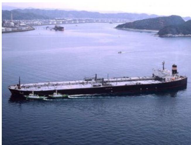
Japan oil tanker Takenaka was attacked off the coast of Yemen in April 2008

With the re-authorisation of the MSDF mission, albeit somewhat constrained compared to its predecessor, accomplished by parliamentary force majeure in January, the government turned to the longer-term question of expanding the country's military involvement in Afghanistan and the Middle East. Two options emerged: committing ground and air elements of the SDF to the war in Afghanistan proper, and, when that possibility appeared unlikely to succeed, deploying MSDF destroyers and surveillance aircraft to protect Japanese tankers from pirate attacks on the route from Middle Eastern oil terminals.