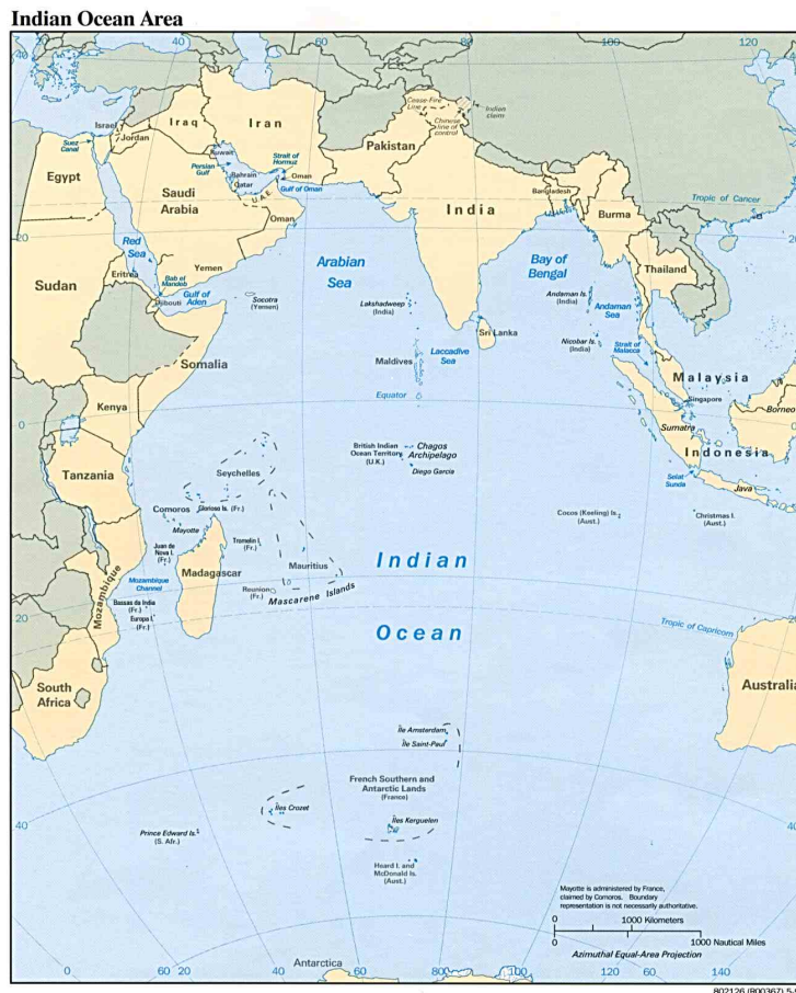
Indian Ocean map