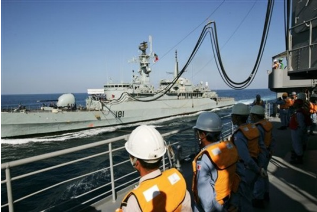
MSDF crew watch refuelling of a Pakistani ship in the Indian Ocean on October 29, 2007

The MSDF was first dispatched to the Indian Ocean in support of coalition operations against international terrorism in Afghanistan and the surrounding region in November 2001. [8] After the expiry in November 2007 of the original legislation authorising the MSDF mission, the Replenishment Support Special Measures Law in January 2008 passed the lower house for the second time on January 11, 2008, in order to open the way to "contributions to efforts by the international community for the prevention and eradication of international terrorism." [9]