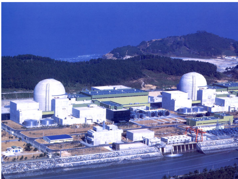
ROK Yonggwang Nuclear Power Plant

The long-term energy plan is regarded as overly ambitious considering the country lags in the development of new energy sources technology, Critics said it was hastily devised following President Lee's Aug. 15 Liberation Day speech, which highlighted so-called "green growth" that was more attentive to environmental protection.