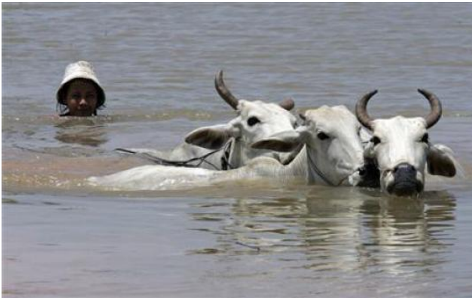
A woman guides bulls to higher ground in the Mekong near Phnom Penh

Thailand has estimated damages at around 220 million baht (US$6.48 million), while the Vientiane Times, a state-controlled Lao newspaper, cited an unofficial government report that the floods would cost Luang Prabang province alone some 100 billion kip (US$11.6 million). Those figures may only be provisional, as flood waters in the Mekong Delta have already reached critical levels and Vietnamese forecasters have predicted more flooding before the end of the rainy season.