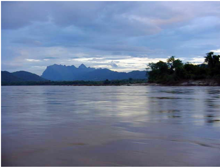
The Mekong in Laos

Flood waters in recent days inundated parts of Luang Prabang and Vientiane provinces in Laos and at least seven northern provinces in Thailand. The flooding was widely reportedly the worst in a century for some areas, with river levels reaching a high of 13.7 meters on August 14. Previous record high floods occurred in 1966, when river levels reached 12.4 meters.