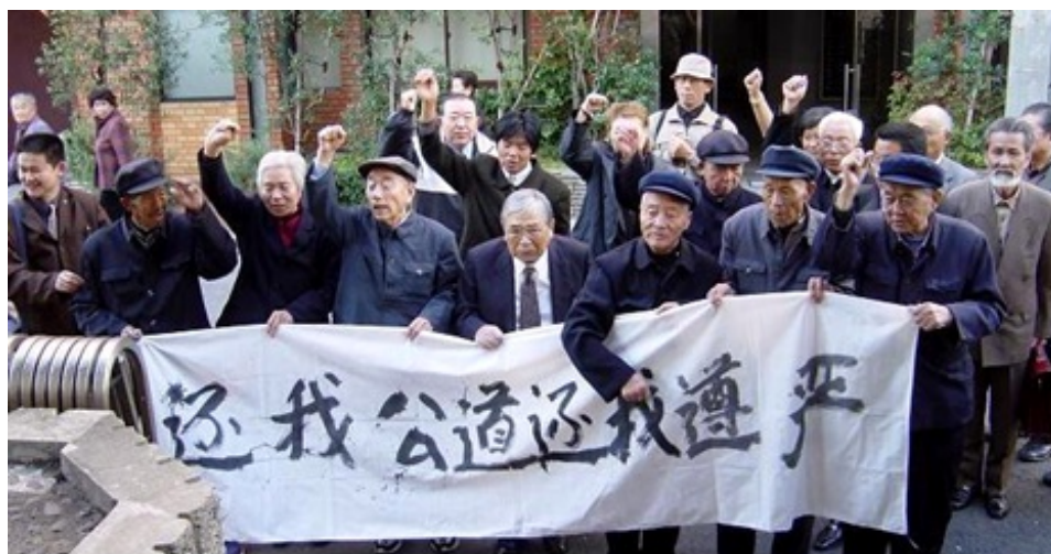
Chinese plaintiffs enter Nagasaki court to demand payment for wartime forced labor, 2004

Under the Labour Mobilization Laws of 1939, companies were able to recruit labour in the colonies; under a revised scheme initiated in 1942, they submitted requests to the appropriate government authorities, who then vetted them and passed on “quotas” for labour recruitment to colonial officials in various regions of Korea. How these officials fulfilled their quotas was very much a matter for local discretion, but might include anything from financial inducements, to threats and promises, to outright force. A direct system of labour conscription was introduced in 1944. (Pak 1975, 14) Similar methods were used (though on a somewhat smaller scale) to recruit labourers from Manchuria and North China, and prisoners-of-war from China were also sent to work in Japan (Vasishth 1997, 130-131; Sugihara 2002) Most notoriously, a combination of deception and threats was in many cases used to recruit women for employment in military brothels during the Pacific War: about 80% of women conscripted into military prostitution are believed to have come from Korea.