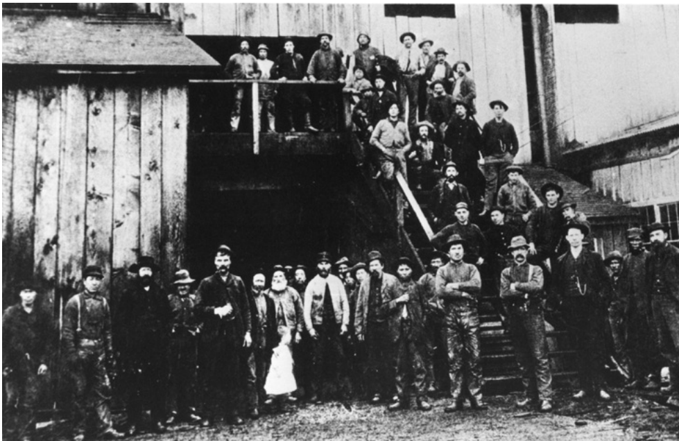
Japanese migrants in Vancouver, 1892