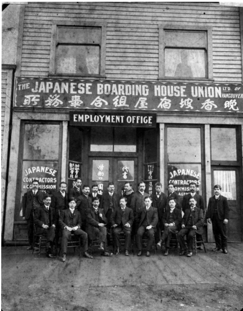
Labor contractors in Vancouver