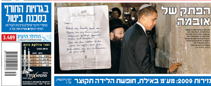
Ma'ariv, one of the largest daily newspapers in Israel

Michael Steinhardt is a former hedge-fund manager and the co-founding chairman of Taglit-Birthright Israel, a program, established in 1999, that pays for Jewish youths to go to Israel each year. He is friendly with Adelson, who is a fellow-contributor to Birthright. "These things are not done to make money," Steinhardt said of Adelson's new media initiatives. "They're done because Sheldon's an ideologue—he really cares about things that are of the spirit and not of the pocketbook."