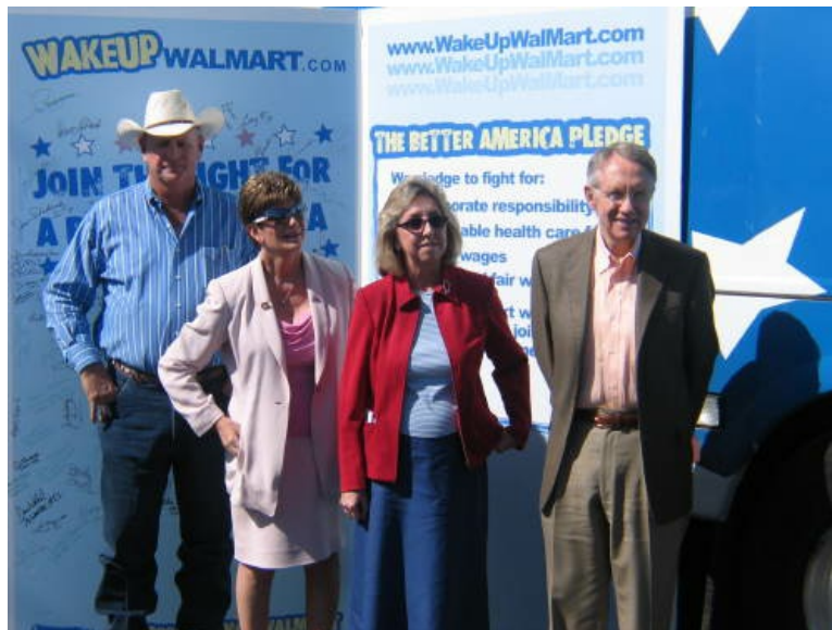
Congresswoman Shelly Berkley (second from the left), 2006