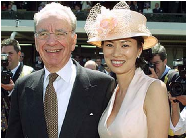
Rupert Murdoch with his third wife, Wendy Deng in 2001

In many cases, billionaires have used their control of media to solidify their influence in politics. This was the strategy in Canada of Conrad Black, for a time (before his conviction on fraud charges) "the third biggest newspaper magnate in the world." [1] Americans will think immediately of the startling career of Rupert Murdoch and News Corp. In Australia in 1975 Murdoch's newspaper supported the Governor-General's strange dismissal of Australian Prime Minister Gough Whitlam, by exercise of a royal prerogative last used by King William IV of England in 1834. Then in England Murdoch used The Times to help elect Margaret Thatcher, who in turn passed legislation enabling Murdoch to crush the powerful trades unions of Fleet Street. In America, Murdoch's Fox News, New York Post, and Weekly Standard underwrote the meteoric rise of the neocons in the Project for the New American Century (PNAC), whose Chairman was William Kristol, editor of The Weekly Standard. [2]