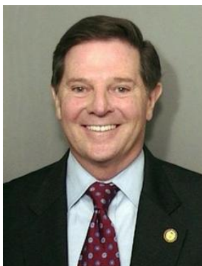
Tom DeLay, House Majority Leader 2003-2005