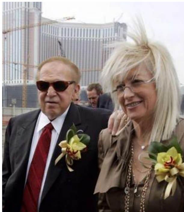
Sheldon and Miriam Adelson in 2007

According to two people who know Adelson well, Miriam influenced his political views on Israel, which have become more conservative. By the mid-nineties, Adelson and Netanyahu had formed a close relationship; in Israel's 1996 election, in which Netanyahu defeated the Labor candidate for Prime Minister, Shimon Peres, by a mere thirty thousand votes, Adelson was widely reported to be a key backer.