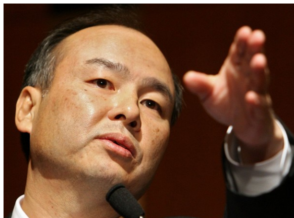
Son Masayoshi, Chief Executive Officer (CEO) of Softbank Mobile and Softbank group, announces the company's new mobile phone price plan at a press conference in Tokyo in January 2007.