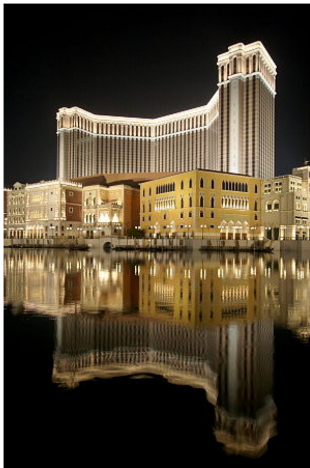
The 40-storey $2.4 billion Venetian Macao Resort Hotel in Macau opened on August 28, 2007

In May, 2004, the first gamblers entered the Sands Macao. Its construction costs were two hundred and sixty-five million dollars, and Adelson made back his initial investment in a year. In December, 2004, Adelson took Las Vegas Sands public (according to Forbes, he owns sixty-nine per cent of the stock) and became a multibillionaire, overnight. The following year, Macao drew 10.5 million mainland Chinese visitors, a hundred and forty-seven per cent more than three years earlier—reflecting an easing of travel restrictions and an increase in the number of newly wealthy Chinese. By the end of 2006, Macao had become the top gambling center in the world, with gaming revenues exceeding $6.9 billion, a quarter of a billion dollars more than those on the Las Vegas Strip. In 2007, revenues climbed to $10.3 billion. That year, Adelson opened the $2.4-billion Venetian Macao—with canals and stripe-shirted gondoliers, as well as an extensive shopping mall and a five-hundred-and-forty-six-thousand-square-foot casino, which is the largest in the world. Since the Sands Macao opened, his personal wealth has multiplied more than fourteen times, and, according to the Times, in the two years after his company went public he earned roughly a million dollars an hour.