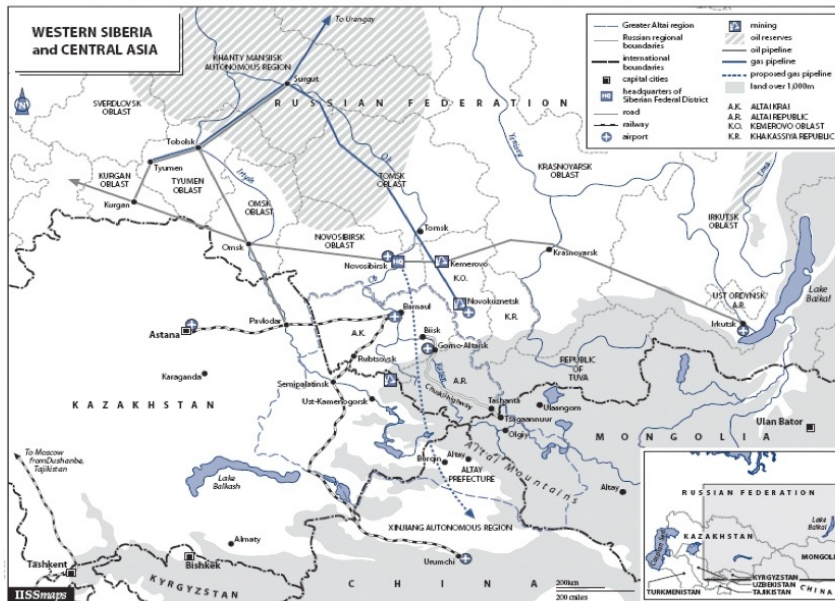
A map of the Altai Republic and its surroundings.

In 2004, we visited the Altai Republic, a remote mountainous region in Southern Siberia, bordering on Kazakhstan, Mongolia, and China. For some time, the republic had been supposedly involved in an international collaboration called "Altai: Our Common Home," supported by the German government. The project focused on economic development, tourism, and — somewhat contradictorily — environmental protection. One of the plan's central elements was a road linking the Altai Republic and China: currently, traffic between them has to detour via Kazakhstan or Mongolia. By the end of 2004, a 140 km road on the Chinese side had been completed, but no progress had been made on the Russian side.