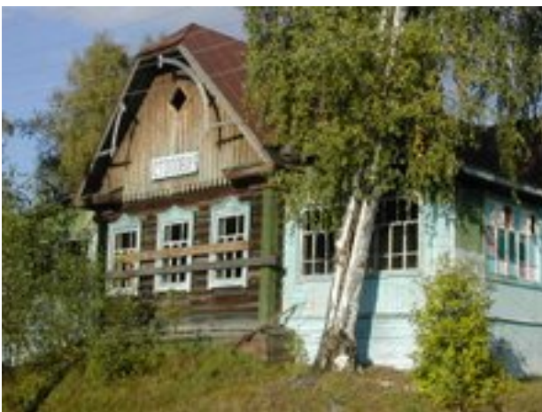
The closed dining hall of a former state-owned tourist base in Artybash.

Almost all visitors arrive in their own cars, but apart from that, tourist practices have not changed much since Soviet times: they include hikes, kayaking, swimming, and an emphasis on the spiritual benefits of "pure nature." Khanas's souvenir stalls, songs, dances, buses, and tour guides are missing. The director of the reserve even forbade local villagers from selling souvenirs. Instead, visitors can contemplate drunks stretched out across Artybash's main street on their morning walks — 70 percent of the village population is unemployed.