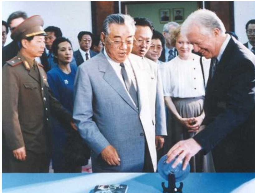
Kim Il Song and Jimmy Carter

The late "great leader" Kim Il Song told former president Jimmy Carter in 1994 that the fundamental problem between the U.S. and the DPRK is lack of mutual trust and therefore the main task for both countries is to "create trust" as a first step to improved relations. [1]