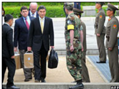
U.S. envoy Sung Kim bearing North Korean documents

The Bush administration belatedly but rightly started to focus on plutonium. The 19,000 pages of documents the North Koreans turned over to Washington are still being reviewed at this writing as part of an effort to verify the correct amount of plutonium that the North Koreans had extracted from spent fuel rods. The North Koreans initially said they had accumulated 30 kilograms of plutonium. Now it says it produced a total of 38 kilograms, an amount still smaller than U.S. estimates of 40 to 50 kilograms, which would be enough to make 6 to 10 bombs. [5]