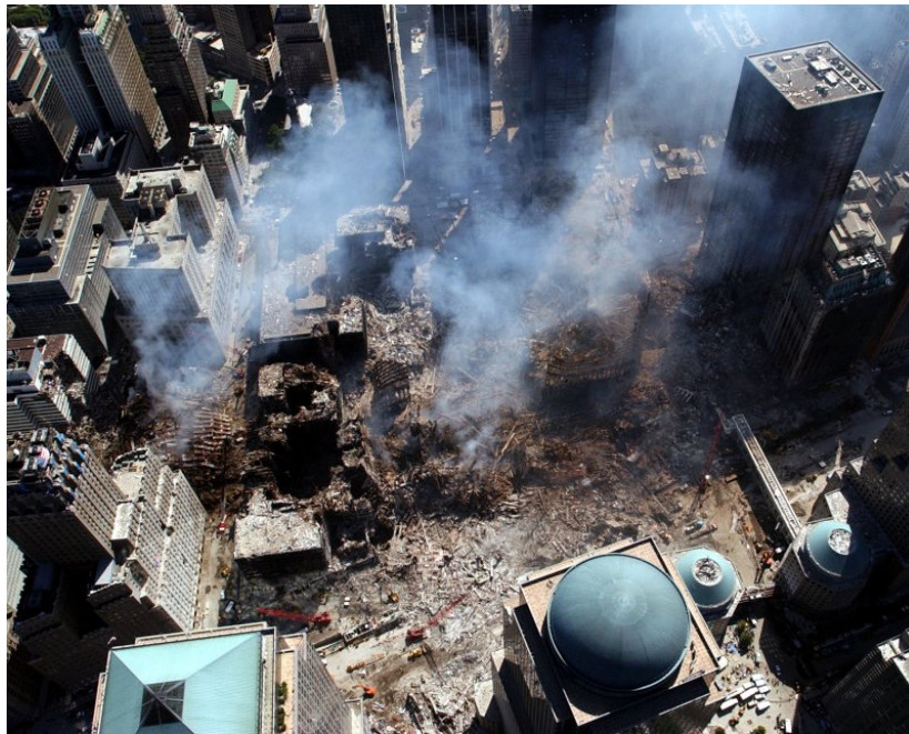
The 9-11 attack on the World Trade Center

As I describe in the forthcoming expanded reissue of my book The War Conspiracy , this culpable withholding of crucial evidence from the FBI by the CIA closely parallels the CIA's withholding from the FBI of important information about Lee Harvey Oswald in October 1963. Former FBI Director Clarence Kelley in his memoir later complained that this withholding was the major reason why Oswald was not put under surveillance on November 22, 1963. [32] Without these withholdings, in other words, neither the Kennedy assassination nor 9/11 could have unfolded in the manner in which they did.