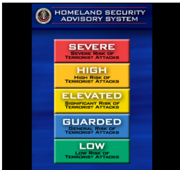
Homeland Security Advisory System

The Directive, without explicitly saying so, appeared to override the post-Watergate statutory provisions for congressional regulation enacted in 1977 by the National Emergencies Act. [76]