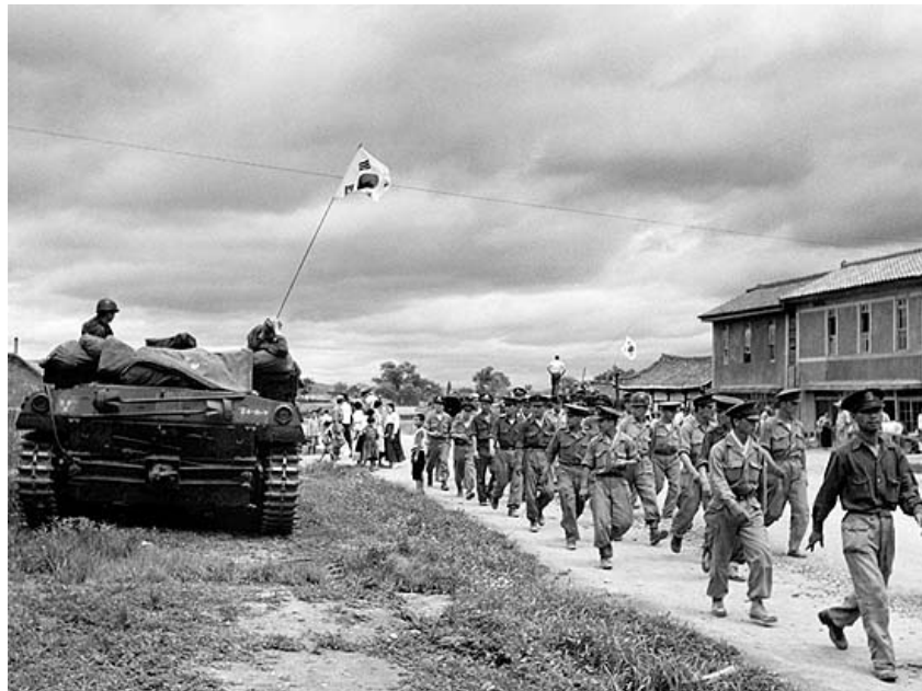
South Korean troops march past an American tank crew near TaejAn, 1950.

The continuity of past deep events is part of the problem facing those who wish to understand and correct what underlies them. For the mainstream U.S. media (as we now clearly see them) have become so implicated in past protective lies about Korea, Tonkin Gulf, and the JFK assassination that they, as well as the government, have now a demonstrated interest in preventing the truth about any of these events from coming out. [44]