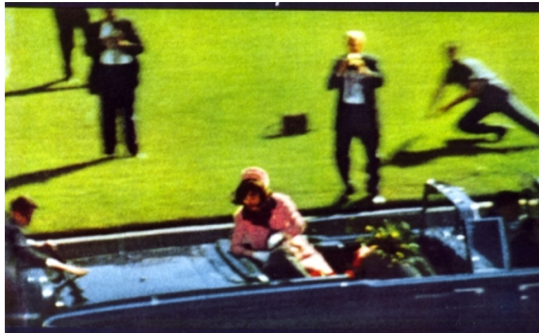
John F. Kennedy's assassination, November 1963

Recent history has seen a number of such events, such as the assassination of John F. Kennedy, that are so inexplicable by the public notions of American politics that most Americans tend not even to think of them. Instead most accept the official surface explanations for them, even if they suspect these are not true. Or if others say they believe that "Oswald acted alone," they may do so in the same comforting but irrational state of mind that believes God will reward the righteous and punish the wicked.