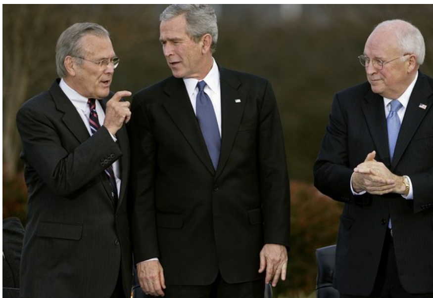
Former US Secretary of Defense Donald Rumsfeld, US President George W. Bush and US Vice President Dick Cheney attend the Armed Forces Farewell Tribute to Rumsfeld at the Pentagon December 15, 2006 in Arlington, Virginia. Praise was heaped on the outgoing secretary by Bush and Cheney, while Rumsfeld used his farewell speech to call for an increase in military spending.

Thus since World War Two the warriorly position, initially that of a marginal but conspiratorial minority, has moved since the Reagan and Bush presidencies into a more and more central position. This is well symbolized by the rise in influence since 1981 of the Council for National Policy, originally funded by Texas oil billionaire Nelson Bunker Hunt and explicitly designed to offset the influence of the Council on Foreign Relations. [66] Comparing the 1950s with the present decade, it is striking how much the status of the State Department has declined vis-à-vis the Pentagon. With the accelerated militarization of the U.S. economy, the question arises whether a more traderly foreign policy can ever again prevail.