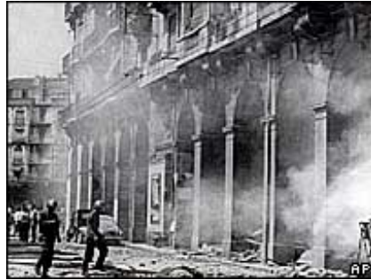
Some 250,000 were killed in the eight-year Algerian independence war

The unthinkable – that elements inside the state would conspire with criminals to kill innocent civilians – has become not only thinkable but commonplace in the last century. A seminal example was in French Algeria, where dissident elements of the French armed forces, resisting General de Gaulle's plans for Algerian independence, organized as the Secret Army Organization and bombed civilians indiscriminately, with targets including hospitals and schools. [1] Critics like Alexander Litvinenko, who subsequently died of polonium poisoning in London in November 2006, have charged that the 1999 bombings of apartment buildings around Moscow, attributed to Chechen separatists, were in fact the work of the Russian secret service (FSB). [2]