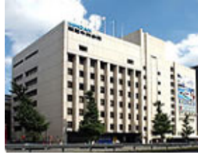
The headquarter of Choryeon (top) and Mindan (bottom) in Tokyo