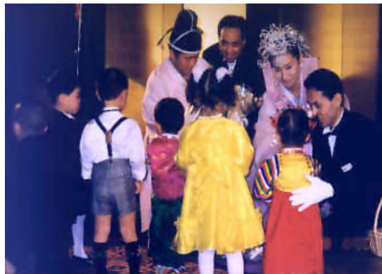
Young Koreans in Japan celebrate wedding in traditional Korean style.

Perhaps it is logical that an oppressed and marginalized ethnic minority, once it begins to receive the benefits of the affluence of the host society, albeit belatedly, would shed its markings of ethnicity and begin to take on the markings of class. Perhaps it is also logical to think that in such a situation class, rather than ethnicity, would become more relevant to forging identity. Unequivocally, however, I remain unconvinced by the argument that a particular category becomes "more significant" than certain others, since the marking of the oppressed is always necessarily multiply compounded.