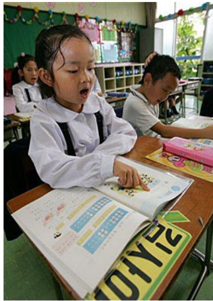
Ethnic Korean students study at a Chongryun-funded elementary school in Tokyo. 2007.

In short, by 1955, within three years of being deprived of Japanese citizenship, Koreans in Japan (or at least Chongryun and its affiliates, which accounted for the majority of Koreans at the time) had banished or exiled themselves from the Japanese civic terrain. During the period when their status had been ambiguous, that is to say, in 1949, when they were not legally excluded from Japanese citizenship status under the Occupation, they were “outlawed”; in 1952, they were excluded from Japanese civic entitlements; in 1955, Koreans themselves embraced this marginalization by effectively declaring that they had no wish to be counted within Japan’s civic life.