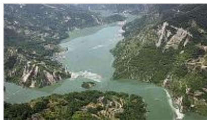
Quake lake bird's eye view

The clear and present danger is a subsequent breach that sends a flood of water hurtling toward villages and towns downriver. In the worst case scenario, this flood of water would, in turn, knock out other dams damaged by the quake and create a disaster every bit as damaging as the original quake. After the quake, as many as 391 hydroelectric dams in five provinces are in "dangerous condition," stated the National Development and Reform Commission, the nation's top economic planning agency. As an indicator of the severity in some situations, Tan Li, the Communist Party secretary of Mianyang and head of the city's earthquake control and relief headquarters, ordered that 1.3 million people should evacuate the area and move to higher ground (Xinhua News Agency, May 30; China Daily, June 1).