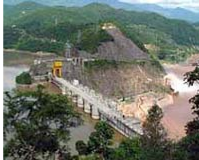
The Manwan Dam

China’s grand Mekong River design will eventually include 15 large dams. The first two, the Manwan and Dachaoshan, were completed in 1993 and 2002, respectively. Together, they generate close to 3,000 megawatts of electricity—equivalent in output to about three large nuclear reactors.