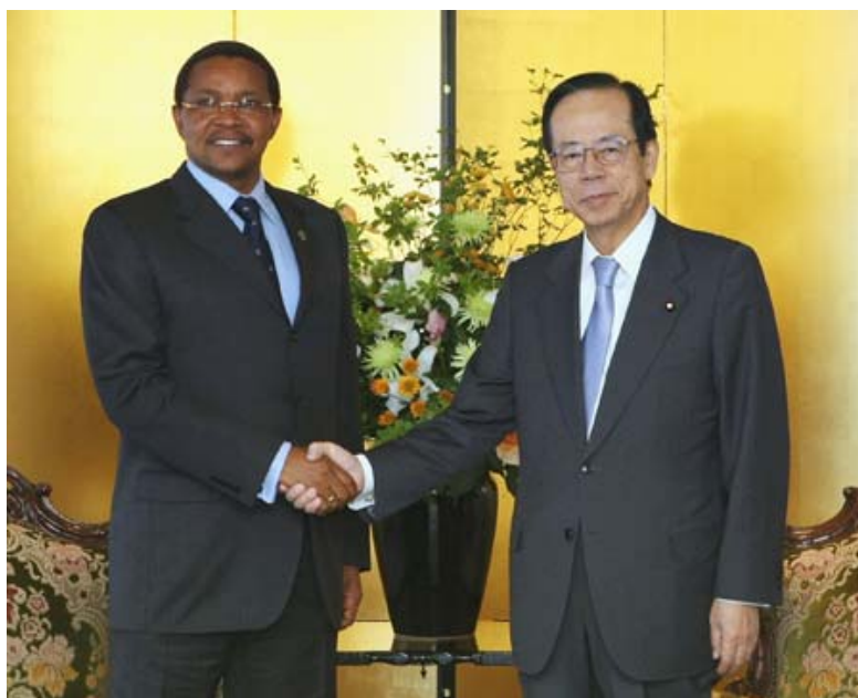
Pres. Kikwete and Prime Minister Fukuda

But, he added: "Africa needs more ODA to develop its infrastructure, develop its human capital, and improve the provision of basic social and economic services."