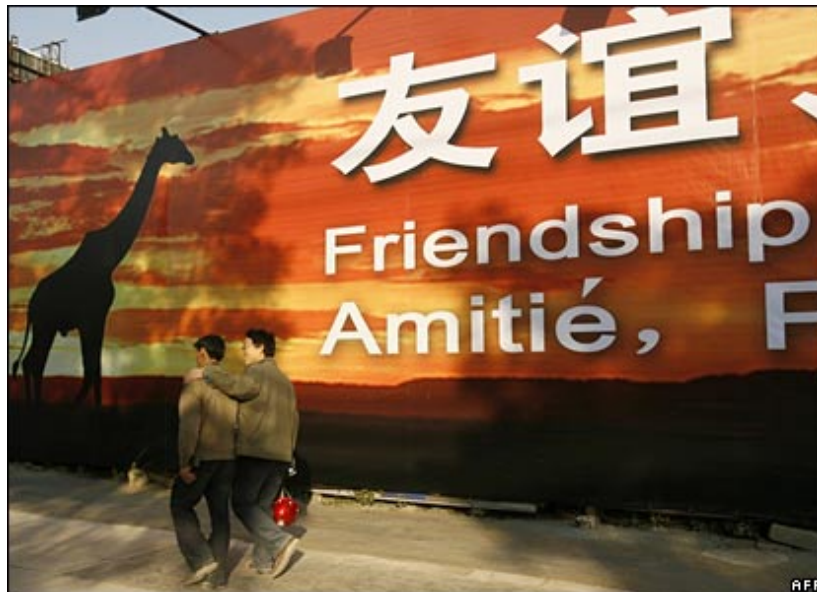
China-Africa summit 2006

China's total trade with African countries came to 73.5 billion dollars in 2007. Total trade between Japan and Africa was 26.6 billion dollars in 2007. "This conference has been assisting African countries since 1993. As this year's host, we wanted to be more competitive than China," a government official said.