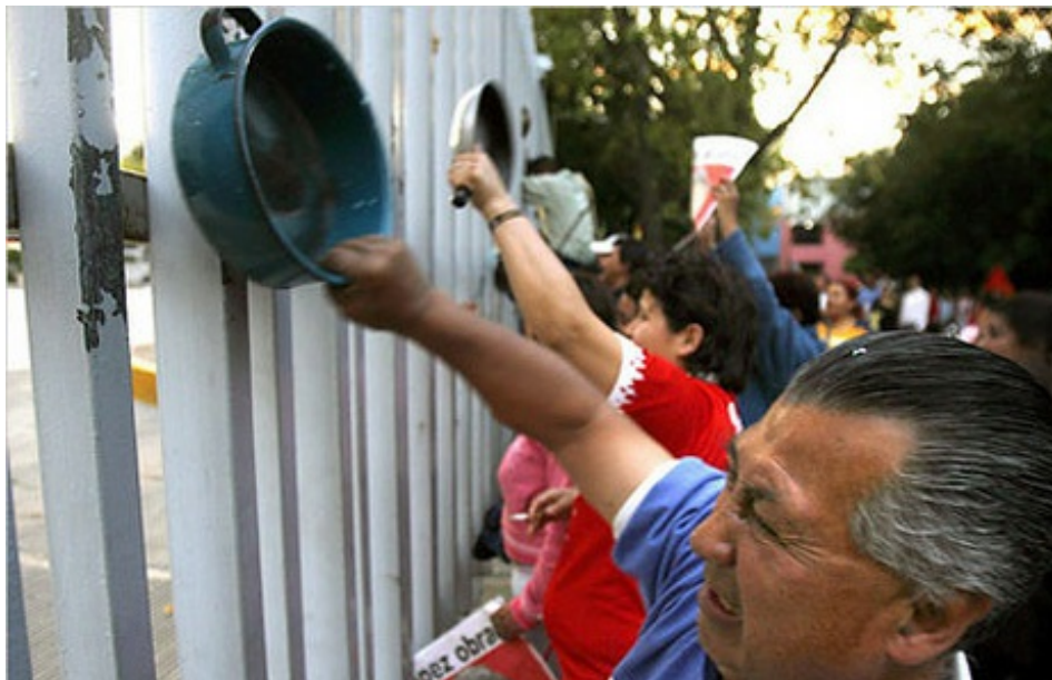
Mexican food protest

The Mexican food crisis cannot be fully understood without taking into account the fact that in the years preceding the tortilla crisis, the homeland of corn had been converted to a corn-importing economy by "free market" policies promoted by the International Monetary Fund (IMF), the World Bank and Washington. The process began with the early 1980s debt crisis. One of the two largest developing-country debtors, Mexico was forced to beg for money from the Bank and IMF to service its debt to international commercial banks. The quid pro quo for a multibillion-dollar bailout was what a member of the World Bank executive board described as "unprecedented thoroughgoing interventionism" designed to eliminate high tariffs, state regulations and government support institutions, which neoliberal doctrine identified as barriers to economic efficiency.