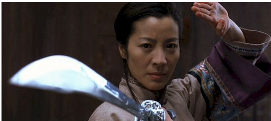
Crouching Tiger, Hidden Dragon

Tan would not be the first Asian artist to have reimported, as it were, Asian traditions from Western sources. Many Japanese rediscovered Zen in the 1960s by reading the American beat poets. But Chineseness from a world point of view is precisely what many Chinese in China didn't like about "Crouching Tiger, Hidden Dragon." However slickly made and beautiful to look at, this kung-fu movie, with Tan's score and Yo-Yo Ma's sinuous cello, smacked to them of a fantasy tailored to Western taste. It could also be read the way I read it, as a nostalgic dream of overseas Chinese about a China that never was. But in fact Tan deals less in nostalgia than in juxtaposition, throwing elements from different cultures together.