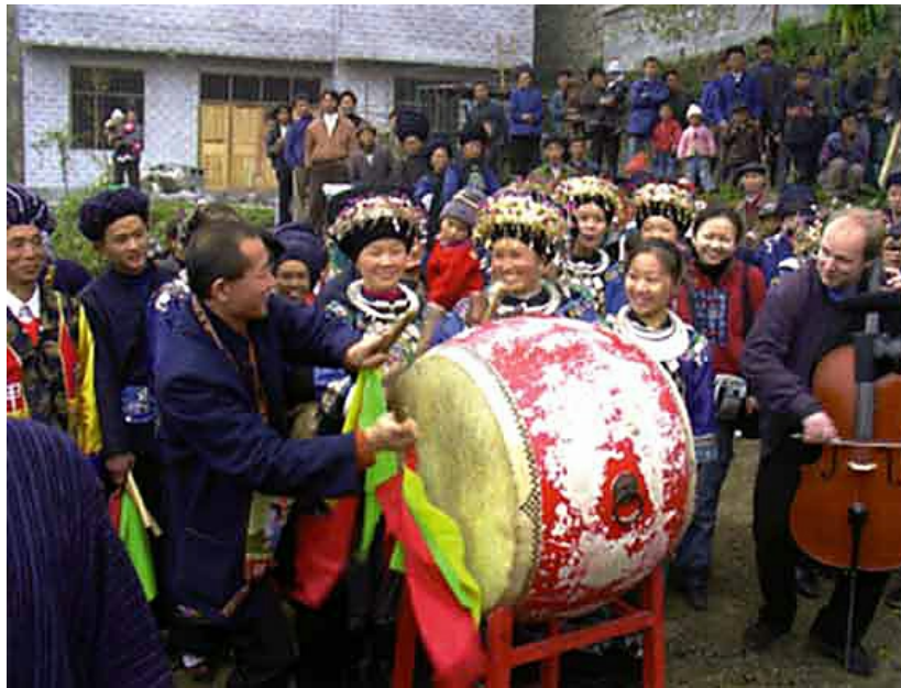
Tan Dun returns to a Miao village in Hunan for his The Map

I asked Tan how it was received by the local people. "The farmers were more open than the civilized bourgeoisie," he replied. "They touched the cello, because it was shiny and beautiful and they were worried that it was too cold. They talked to the instrument as if it were alive, in the spirit of the ghost operas."