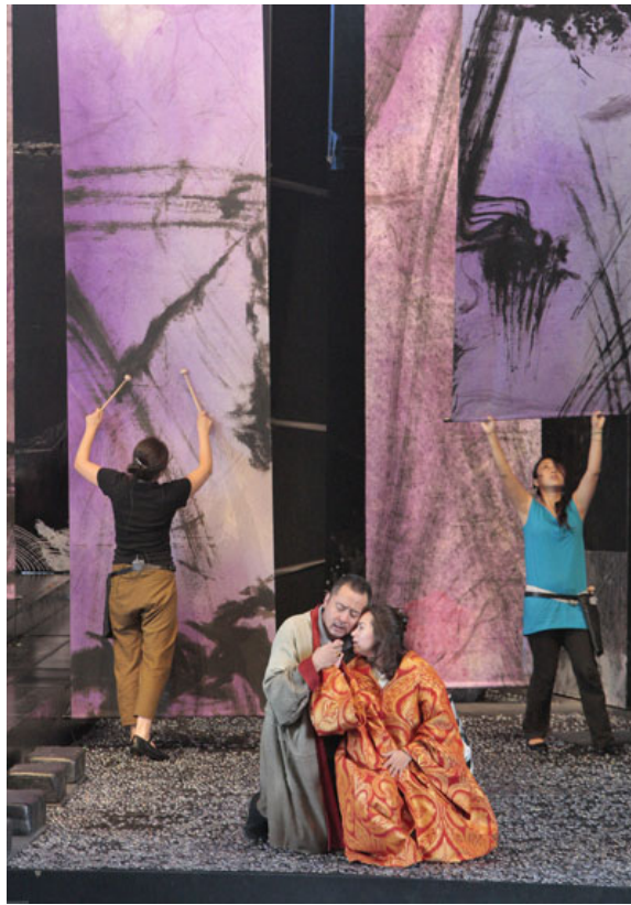
Tea performed in Santa Fe

There is no question that Tan uses Chinese culture in his music. The question is which Chinese culture. It may not be a culture that most contemporary Chinese people would recognize. Like the fortune cookie, much of it feels as if it were invented in America. This is not necessarily a bad thing. James Joyce recreated his Ireland living in Trieste, Paris and other places abroad. Distance can sharpen the imagination. I decided to ask Tan about this after his return to New York, to attend a performance at the Brooklyn Academy of Music of "The Gate," his multicultural opera featuring three theatrical heroines who died for love: Shakespeare's Juliet; Koharu, heroine in the Japanese puppet play "Double Suicide"; and Yu Ji, from "Farewell My Concubine," a Beijing opera about a woman who commits suicide for her lord.