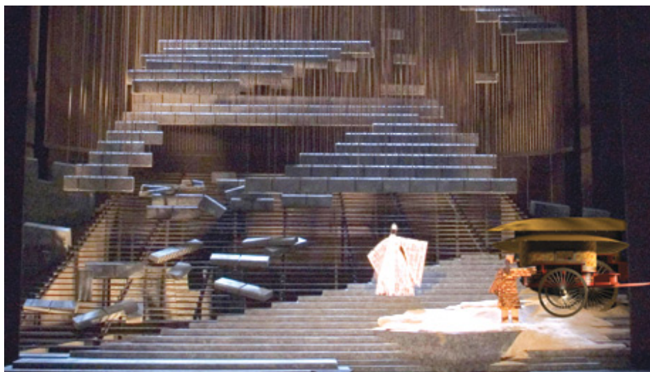
First Emperor staged at the Met

The wise man is also an astute entrepreneur, however. Walking from the hotel to the Konserthus, where the Nobel Prizes are handed out, he was talking in Chinese on his cellphone. After he was done, he turned to me in a state of great excitement. "Just imagine," he said, eyes shining with pleasure. "We've got permission to perform 'The First Emperor' on the Great Wall of China for the Beijing Olympics. We'll have a worldwide audience of billions!" Since then, there have been some doubts raised about this project. In fact, the Chinese government may not let it happen after all, but the very idea of it shows the scale of Tan's artistic ambition.