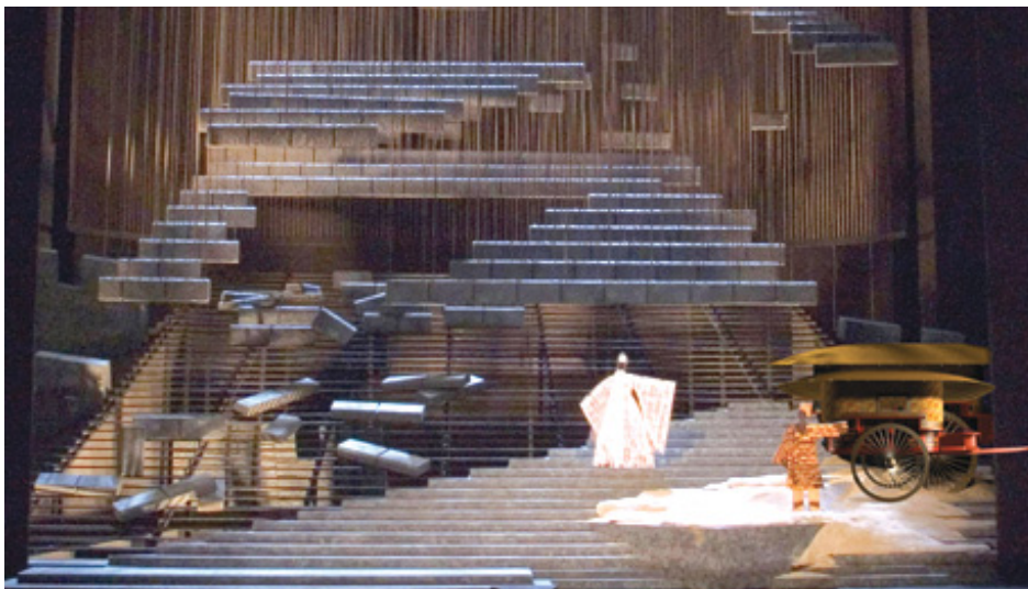
First Emperor staged at the Met

The wise man is also an astute entrepreneur, however. Walking from the hotel to the Konserthus, where the Nobel Prizes are handed out, he was talking in Chinese on his cellphone. After he was done, he turned to me in a state of great excitement. "Just imagine," he said, eyes shining with pleasure. "We've got permission to perform 'The First Emperor' on the Great Wall of China for the Beijing Olympics. We'll have a worldwide audience of billions!" Since then, there have been some doubts raised about this project. In fact, the Chinese government may not let it happen after all, but the very idea of it shows the scale of Tan's artistic ambition.