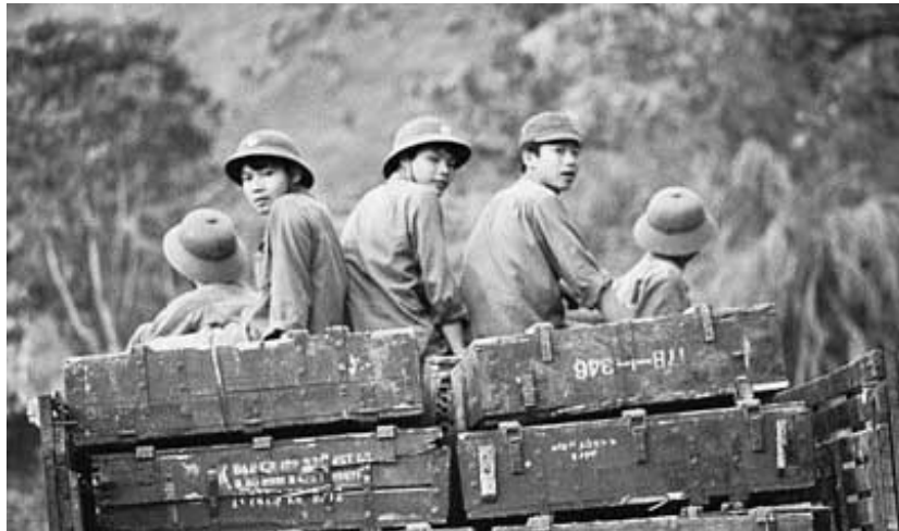
Chinese forces enter Vietnam in the 1979 border war

In 1991, after more than a decade of hostility—the low point of which was a short but intense border conflict in 1979 following Hanoi's occupation of China's ally Cambodia—Vietnam and the PRC normalized relations.