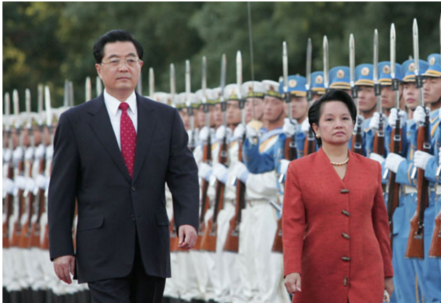
Hu and Arroyo

At a banquet to welcome visiting Chinese President Hu Jintao in April 2005, Philippine President Gloria Macapagal Arroyo proclaimed that in view of China's eagerness to invest in the country's crumbling infrastructure, booming Philippine exports to the PRC, and a recently concluded agreement among the national oil companies of Vietnam, China and the Philippines—the Joint Marine Seismic Undertaking (JMSU)—to conduct seismic research in the disputed waters of the South China Sea, Sino-Philippine relations had entered “a golden age”; her guest graciously concurred.