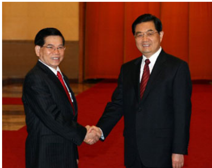
Vietnamese Pres. Nguyen Ming Triet and Chinese President Hu Jintao affirm relations in 2005

Since then, bilateral relations have broadened, deepened and improved to an extent few would have predicted. Today, bilateral relations are guided by the official mantra of "long-term stability, orientation toward the future, good neighborliness and friendship, and all round cooperation" in the spirit of "good neighbors, good friends, good comrades, and good partners."