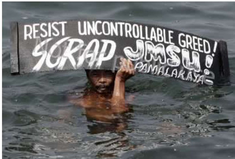
A Filipino fisherman holds a sign calling for scrapping the JMSU

The contents of the FEER article were quickly capitalized on by Arroyo’s opponents, some of whom accused the government of prejudicing the country’s territorial claims in the South China Sea and violating the 1987 Constitution, Article 12 of which stipulates that any consortium undertaking exploratory activities in Philippine waters must be 60 percent owned by Filipinos. Critics assailed the government for selling out the national patrimony; some even called for the president’s impeachment for treason. An even more explosive insinuation followed: that the Philippine leader had agreed to the JMSU as a quid quo pro for Chinese ODA (News Break, March 6). Opposition figures have, however, failed to provide any concrete evidence to back-up this extraordinary and incendiary claim.