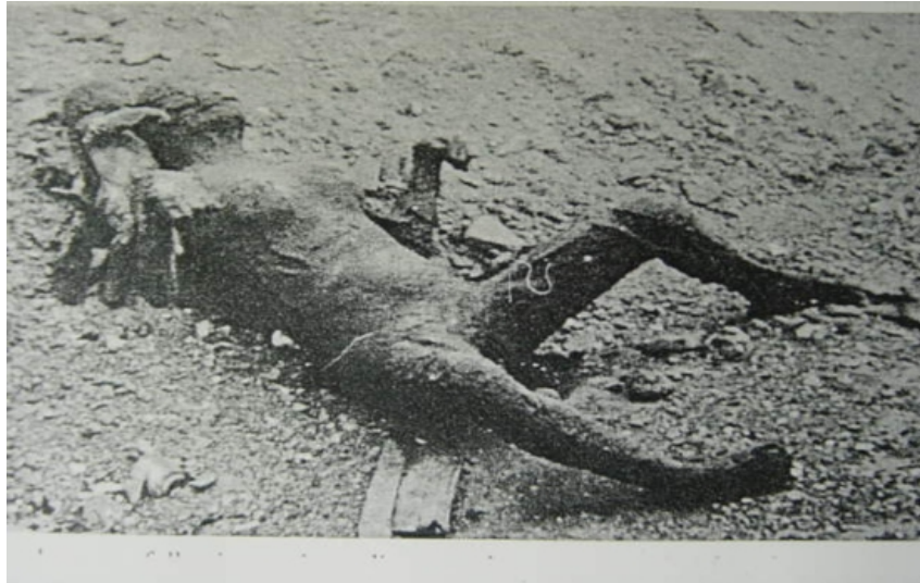
Ishikawa Toyo. A child's corpse in the Tokyo bombing

Many more (primarily civilians) died in the firebombing of Japanese cities than in Hiroshima (140,000 by the end of 1945) and Nagasaki (70,000). The bombing was driven not only by a belief that it could end the war but also, as Max Hastings shows, by the attempt by the Air Force to claim credit for the US victory, and to redeem the enormous costs of developing and producing thousands of B-29s and the $2 billion cost of the atomic bomb. [20]