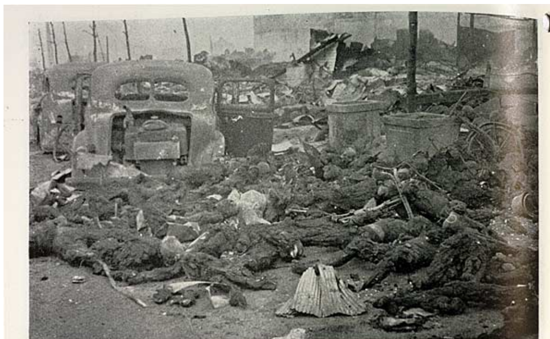
Photo 43.—Japanese photo showing bodies of people trapped and burned as they fled through a street during the attack of 9-10 March. Note that automobiles and bicycles were also trapped and burned.

How many people died on the night of March 9-10, in what flight commander Gen. Thomas Power termed "the greatest single disaster incurred by any enemy in military history?" The figure of roughly 100,000 deaths and one million homes destroyed, provided by Japanese and American authorities may understate the destruction, given the population density, wind conditions, and survivors' accounts. [18] An estimated 1.5 million people lived in the burned out areas. Given a near total inability to fight fires of the magnitude and speed produced by the bombs, casualties could have been several times higher than these estimates. The figure of 100,000 deaths in Tokyo may be compared with total US casualties in the four years of the Pacific War—103,000—and Japanese war casualties of more than three million.