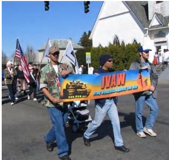
IVAW prepare for Winter Soldier 2008

The importance of apology and reparations lies in the fact that through processes of recognition of wrongdoing and efforts to make amends (however belated or inadequate) to victims, the poisonous legacies of war and colonialism may be alleviated or overcome and foundations laid for a harmonious future. In Germany, this involved renunciation of Nazism, the formation of a new government distinctive from and critical of the former government; consensus expressed in the nation's textbooks and curricula critical of Nazi genocide and aggression; monuments and museums commemorating the victims; and payment of substantial reparations to individual victims (albeit under US pressure). All of these actions paved the way for Germany's reemergence at the center of the European Union.