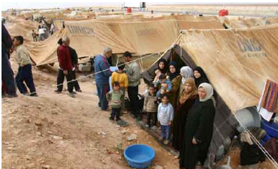
Iraqi refugees on the Syrian border

Both the plight of refugees and the intensification of aerial bombing of 2007 and 2008 have been largely invisible in the US mainstream press, This is the central reality of American state terror in Iraq. Nevertheless, despite America’s unchallenged air supremacy in Iraq since 1991, despite the creation of an array of military bases to permanently occupy that country and anchor American power in the Middle East, as the war enters its sixth year there is no end in sight to US warfare in Iraq and throughout the region. [30] Indeed, as the presidential debate makes clear, there is little prospect of exit for the US from an Iraq located at the epicenter of the world’s richest oil holdings, regardless of the outcome of the election. It is of course a region in which the geopolitical stakes far exceed those in Korea or Vietnam.