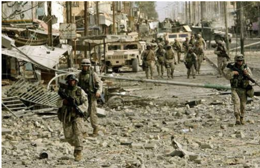
Destroying Fallujah in order to save it

In Iraq, the US military, while continuing to pursue massive bombing of neighborhoods in Fallujah, Baghdad and elsewhere, has thrown a cloak of silence over the air war. While the media has averted its eyes and cameras, air power remains among the major causes of death, destruction, dislocation and division in contemporary Iraq. [28]The war had taken approximately 655,000 lives by the summer of 2006 and close to twice that number by the fall of 2007, according to the most authoritative study to date, that of The Lancet. Air war has also played a major part in creating the world’s most acute refugee problem. By early 2006 the United Nations High Commissioner for Refugees estimated that 1.7 million Iraqis had fled the country while approximately the same number were internal refugees, with the total number of refugees rising well over 4 million by 2008. [29] Nearly all of the dead and displaced are civilians.