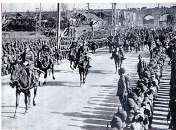
Gen. Matsui enters Nanjing

As Yoshida Yutaka notes, Japanese forces were subjected to extreme physical and mental abuse. Regularly sent on forced marches carrying 30-60 kilograms of equipment, they also faced ruthless military discipline. Perhaps most important for understanding the pattern of atrocities that emerged in 1937, in the absence of food provisions, as the troops raced toward Nanjing, they plundered villages and slaughtered their inhabitants in order to provision themselves. [7]