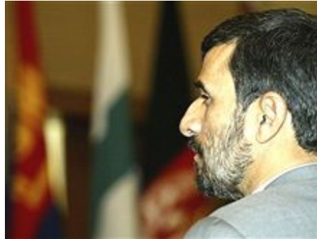
Pres. Mahmud Ahmadinejad of Iran at SCO meeting, July 2007

On March 24, Iran's official media reported that Iran will apply for full membership in the Shanghai Cooperation Organization (SCO), a would-be nascent EU-esque community headed by China and Russia and containing a fistful of continental Asian states.