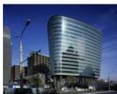
CNOOC in Beijing

While BP, Royal Dutch Shell, Total, and GDF are holding back, China and others are pushing forward. The China National Offshore Oil Corporation (CNOOC) reportedly concluded a deal for a $16 billion investment in Iran's North Pars natural gas field in December—in the midst of negotiations on the third round of UN sanctions.