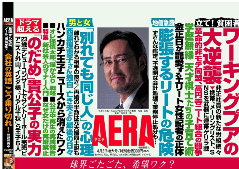
Aera, April 2 nd , 2007 issue, with a special on the working poor

The Japanese lifetime employment system does remain in place for those able to secure permanent employment, although Peter Matanle argues that "management is embarking on a process of attempting to re-fabricate the culture of lifetime employment towards a more fluid and market-based system." [4] Central to this management strategy is the increase in the employment of haken shain , temp agency workers, instead of permanent staff ( seishain ): the number of haken shain increased by 3.5 times from 654,000 to 2.26 million, 1992-2004.[5] This considerable shift in corporate hiring culture reflects companies' efforts to reduce wage bills within Japan's stagnant economy in the face of competition from low-wage economies like China and other developing nations.