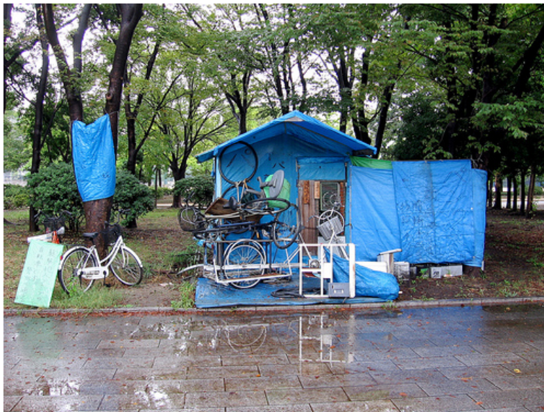
Homeless tent in Osaka’s public park, 2006.