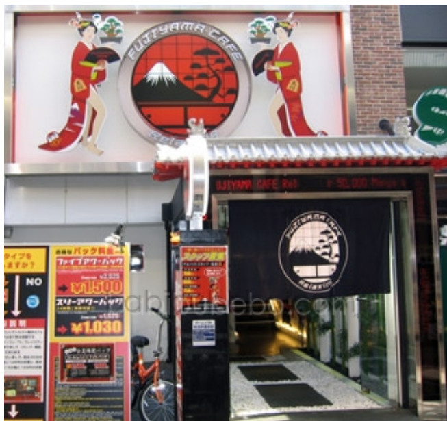
An Internet Café in Kyoto, 2007

But the media interest is undoubtedly making a difference.