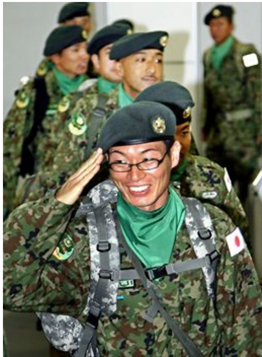
SDF forces deployed to Iraq

Tokyo has since stepped up its cooperation with Washington, from missile defense to the realignment of U.S. forces. 'It shows that Japan and the United States got closer because of the decision to send the SDF to Iraq,' says a senior Foreign Ministry official.