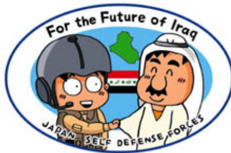
SDF charm offensive in Iraq. This image appeared on Japanese water trucks

Tokyo has since stepped up its cooperation with Washington, from missile defense to the realignment of U.S. forces. 'It shows that Japan and the United States got closer because of the decision to send the SDF to Iraq,' says a senior Foreign Ministry official.