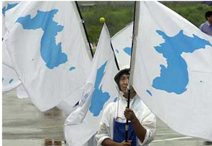
The unification flag used since 1991

During 2007 formal inter-Korean talks on a joint Olympic team took place in Kaesong in February, with more informal contacts in Kuwait in April and in Hong Kong in June 2007, but no solution was achieved. There is considerable agreement on issues such as the flag (the unification flag), the national anthem to be played when medal winners are on the podium (the 1920s version of the traditional Korean folk song 'Arirang'), and the uniforms (following earlier designs but all supplied by the South). One key area remains outstanding – and it is an issue that has remained since those early days of the 1960s – how to choose the athletes to compete.