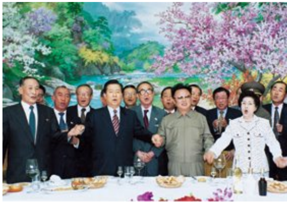
The two Kims and entourage following the June 15, 2000 Joint Declaration

Subsequently, the North participated in the September 2002 Asian Games in Busan, the first ever such occasion for North Korean athletes to participate in an international sporting event in the South. That success seems in part to be due to the South's strategy of avoiding the complicated questions of a joint team and instead focusing on a joint parade at the opening and the participation of North and South Korean athletes in separate teams [6].