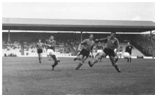
Pak Doo-ik kicks North Korea's winning World Cup goal against Italy

In fact, during the 1960s and 1970s the South Korean government of President Park Chung-hee used sports promotion as one of several means to create a national revival in the wake of the traumas of colonization and war. Labelled by some as the 'father of modern sport', Park introduced a number of innovative sports policies at both the elite and mass level and the idea of hosting the Olympics originated during his years in office. In North Korea too sporting activity became an important part of societal mobilization and development. Mass sports involving gymnastics became a regular feature of North Korean society. Nonetheless, throughout the 1960s and 1970s both Koreas remained relatively low-key in terms of participating in international sporting events, with the notable example of the North Korean soccer team's almost legendary exploits in the 1966 World Cup in England.