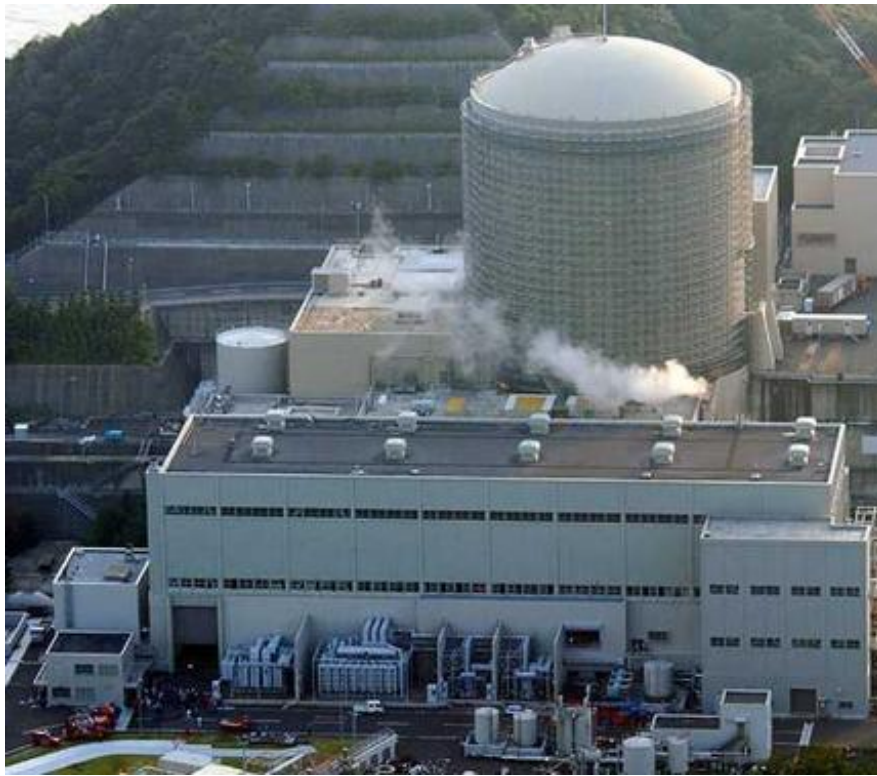
Steam billows from the Mihama nuclear power plant in a 2004 accident

Our principal challenge is to establish universal principles for the promotion of nuclear energy to contribute to sustainable growth in the global economy, to solve global warming problems, and to meet energy security needs, in balance with furthering efforts to reduce the risks posed by the threats of nuclear proliferation, nuclear terrorism, and existing nuclear weapons. We also need to remember that the safety of nuclear activities has become an increasingly important element in maintaining the credibility and sustainability of nuclear energy activities.