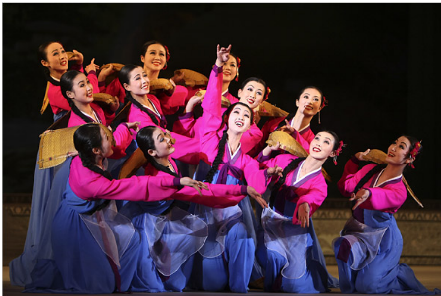
Korean dancers welcome the New York Philharmonic